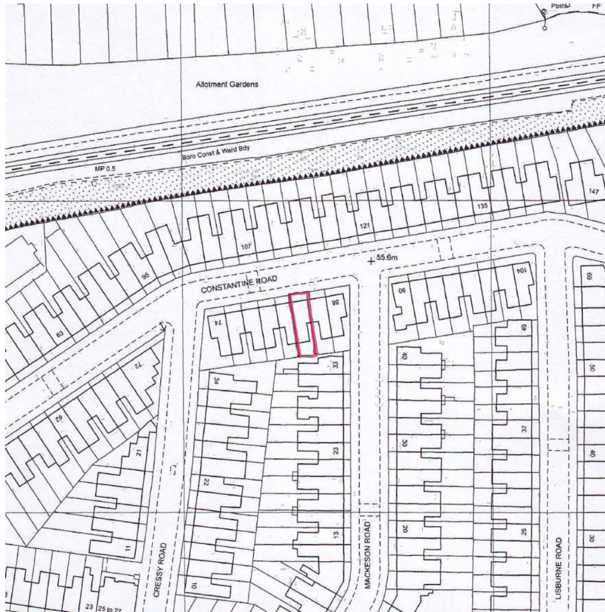
LOCATION PLAN @1:1250