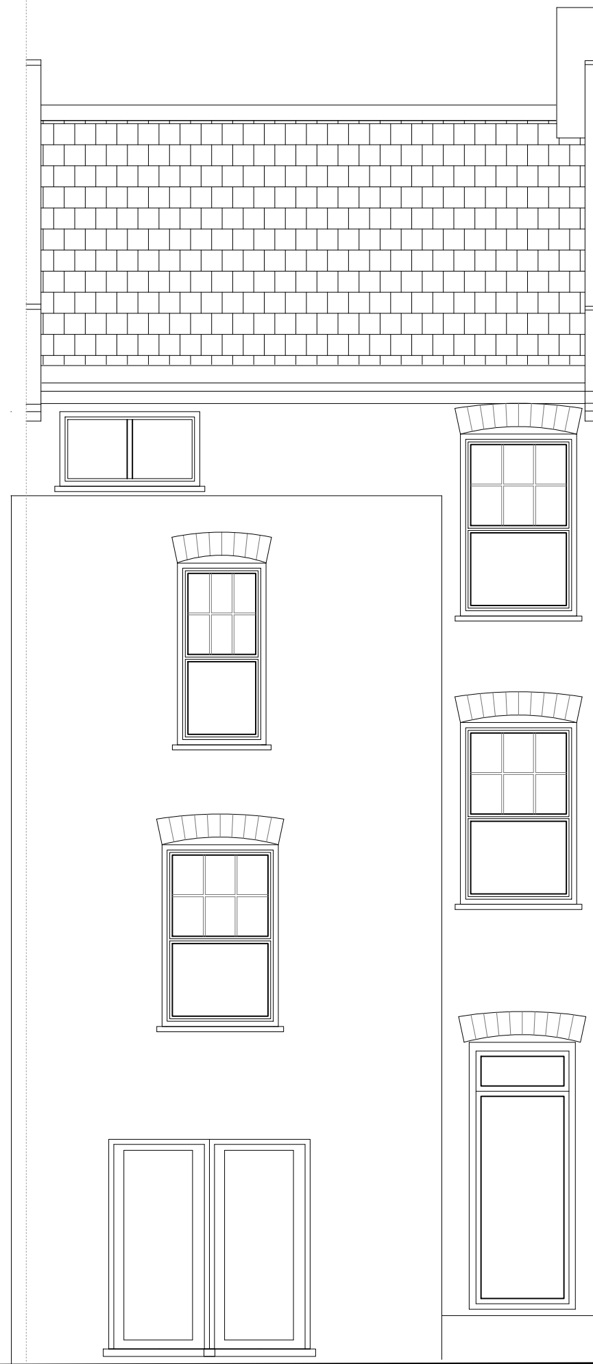
REAR ELEVATION [AS PRE-EXISTING]