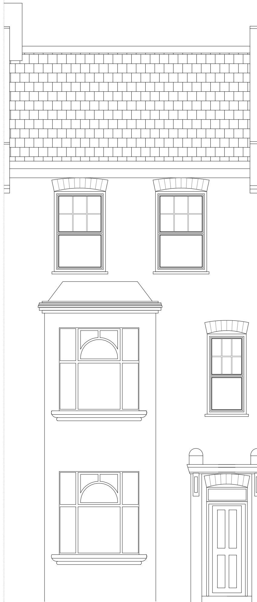
FRONT ELEVATION [AS PRE-EXISTING]