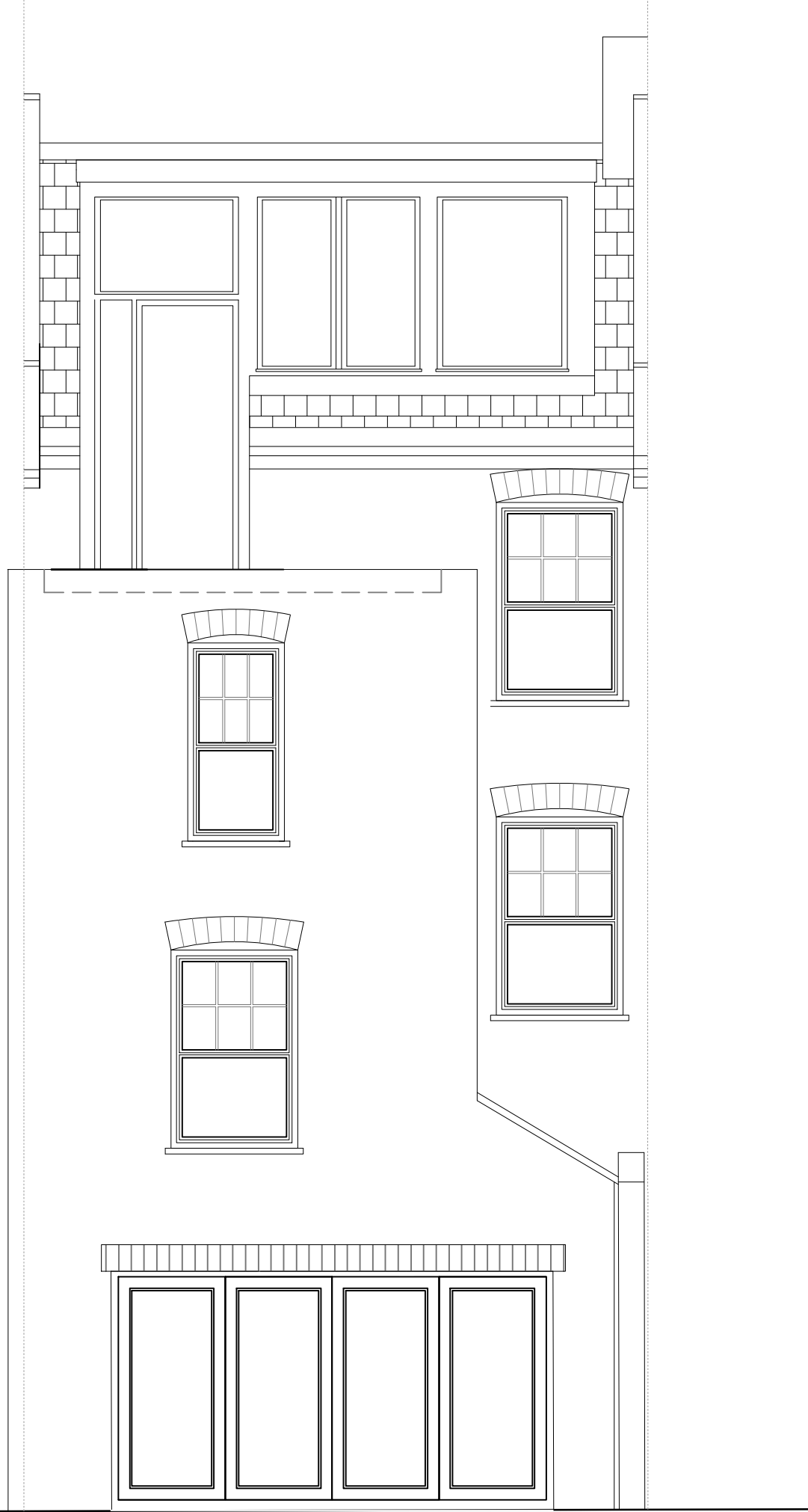
REAR ELEVATION [AS PRE-EXISTING]