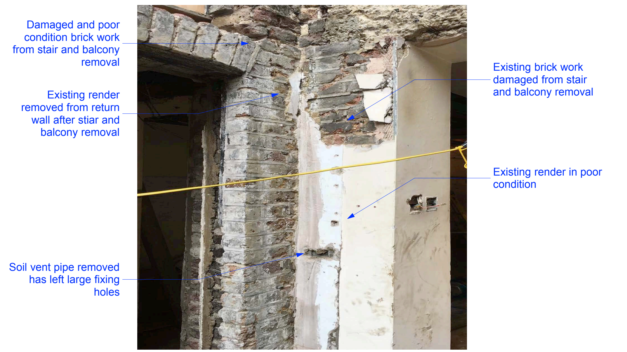
3 EXTERIOR ELEVATION

Damaged brick from existing window opened up to become new walk through