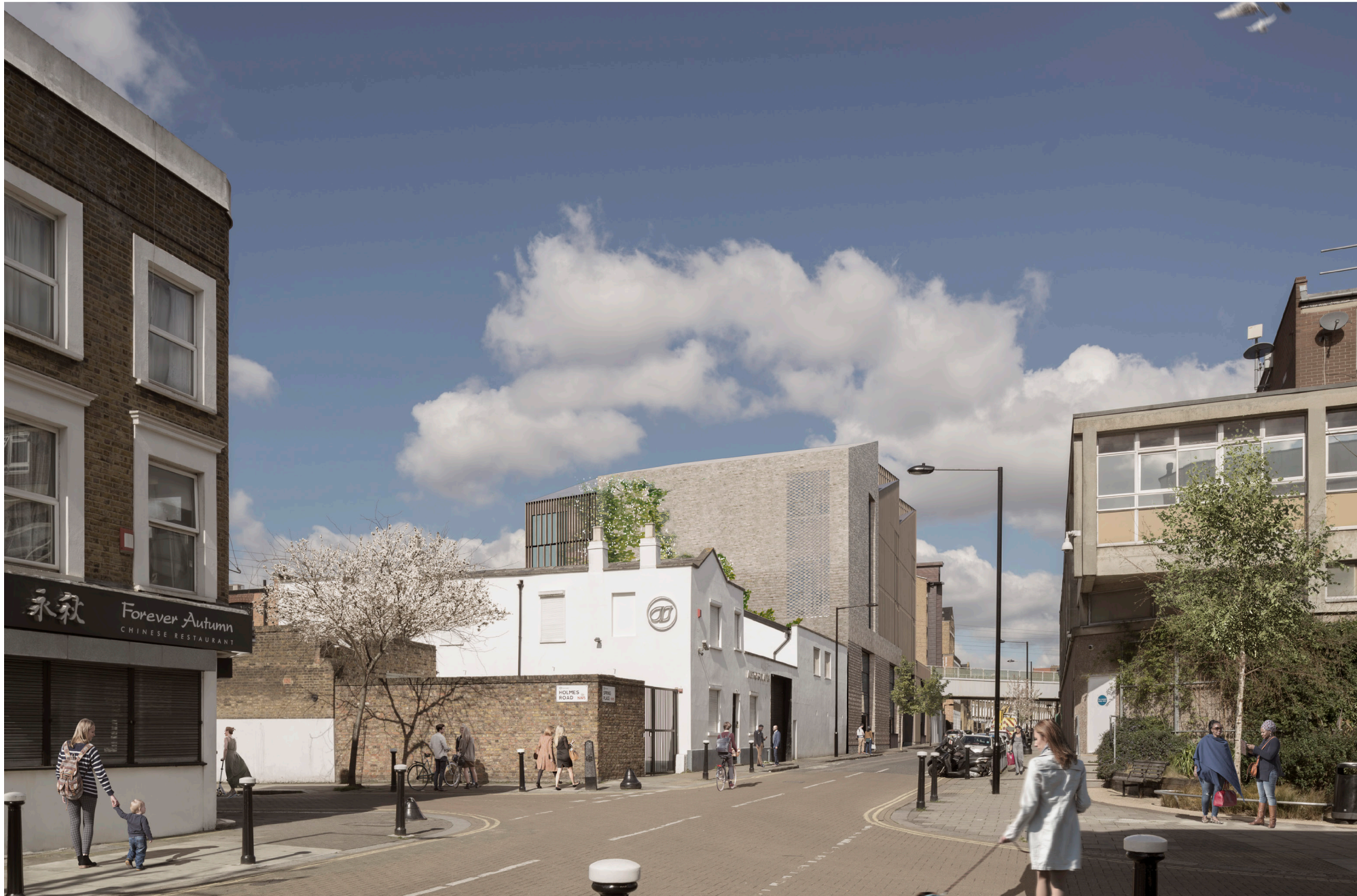
South facade - preferred updated scheme

The scale of this opening is better in keeping with the Spring Place frontage and will change character/transparency depending on the time of day.