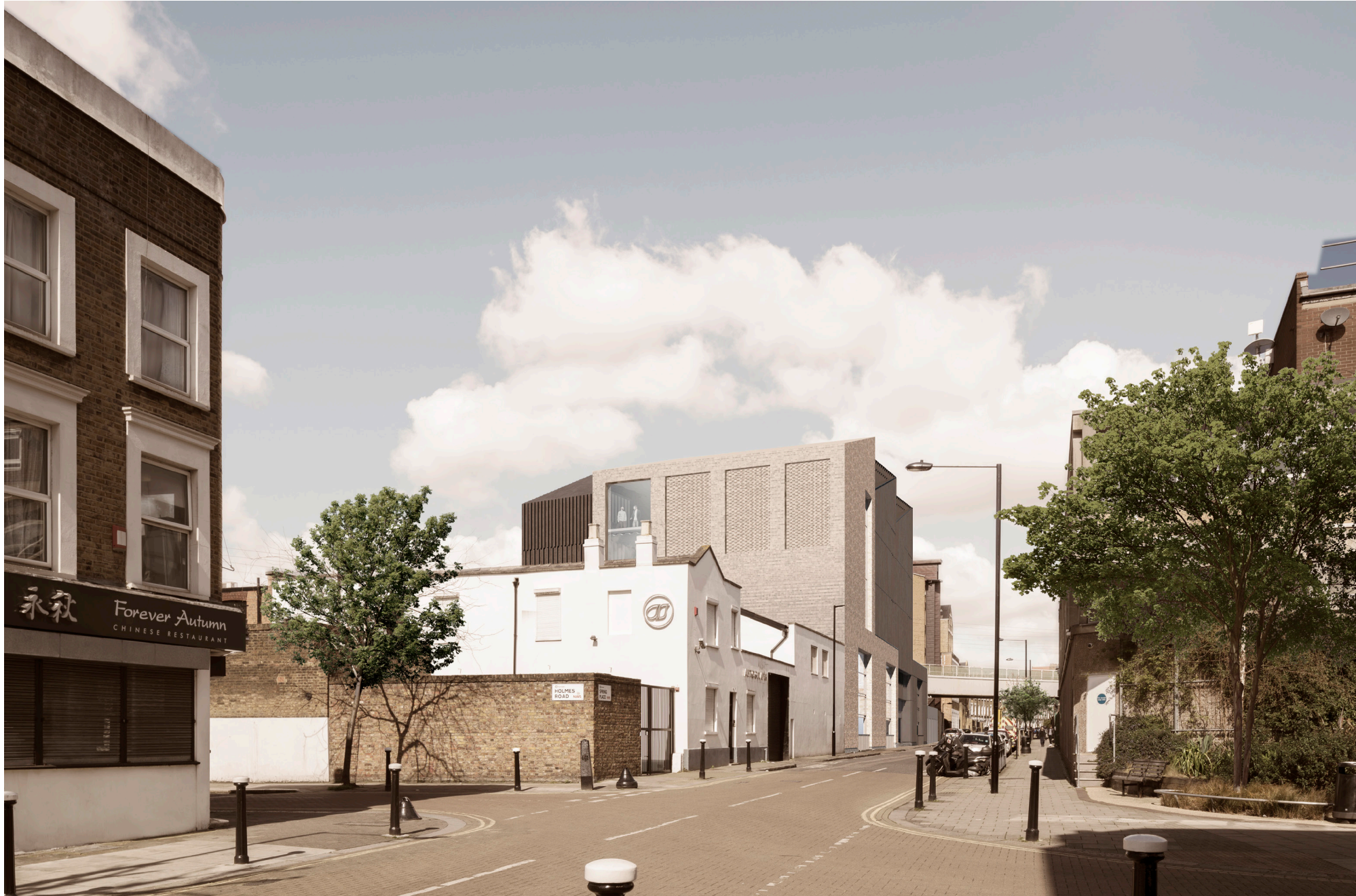
South facade previous iteration

In this option the textured brick treatment applied to the Spring Place plinth is extended to the lower part of the southern facade, fading towards the top. The upper part of the facade follows the same textured brick treatment with a series of infilled brick bays and a window to the west.