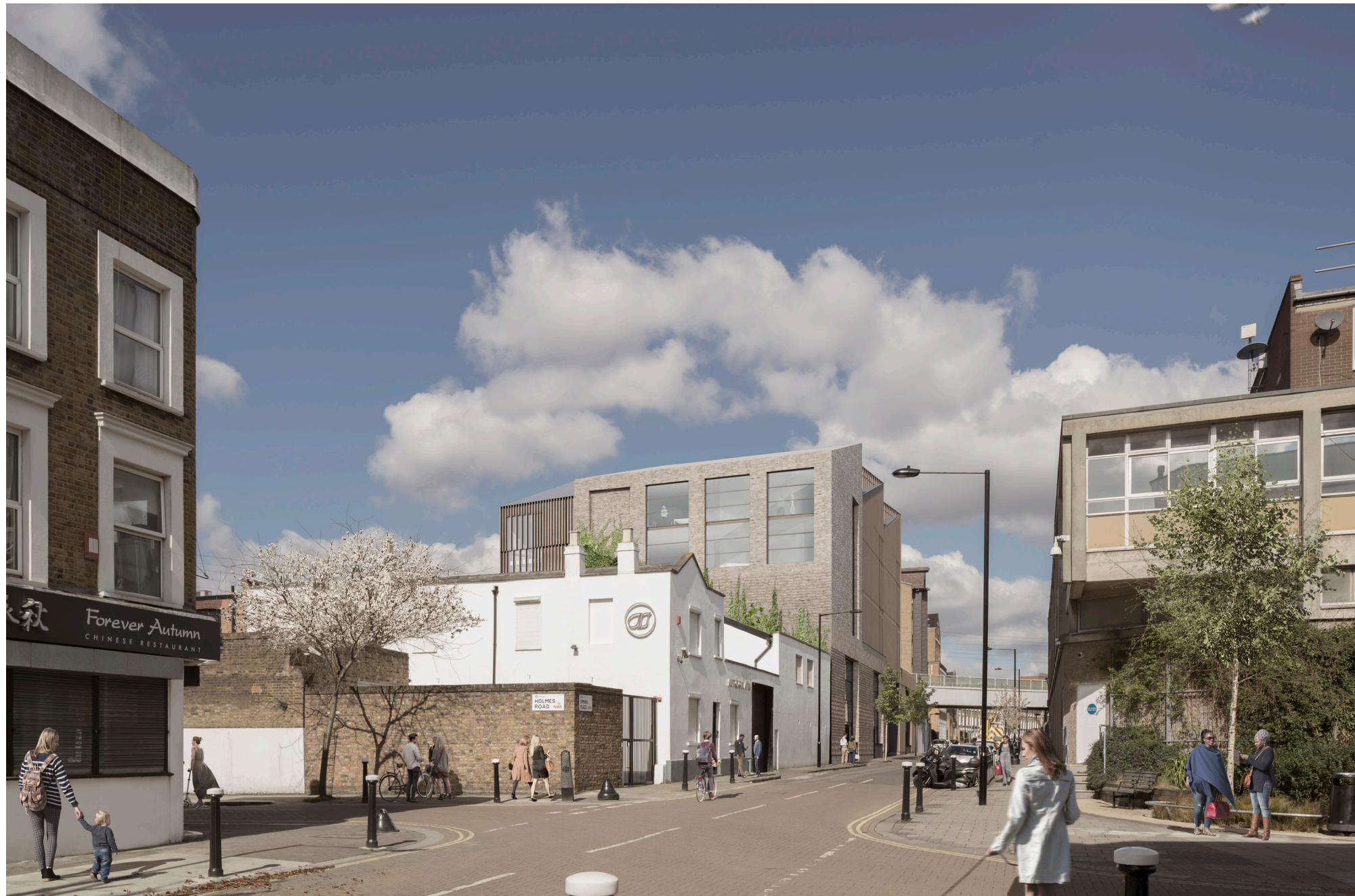
South facade of submitted proposal

The proposal showed a textured brick with a series of openings in an effort to increase the openness of the facade towards the south.