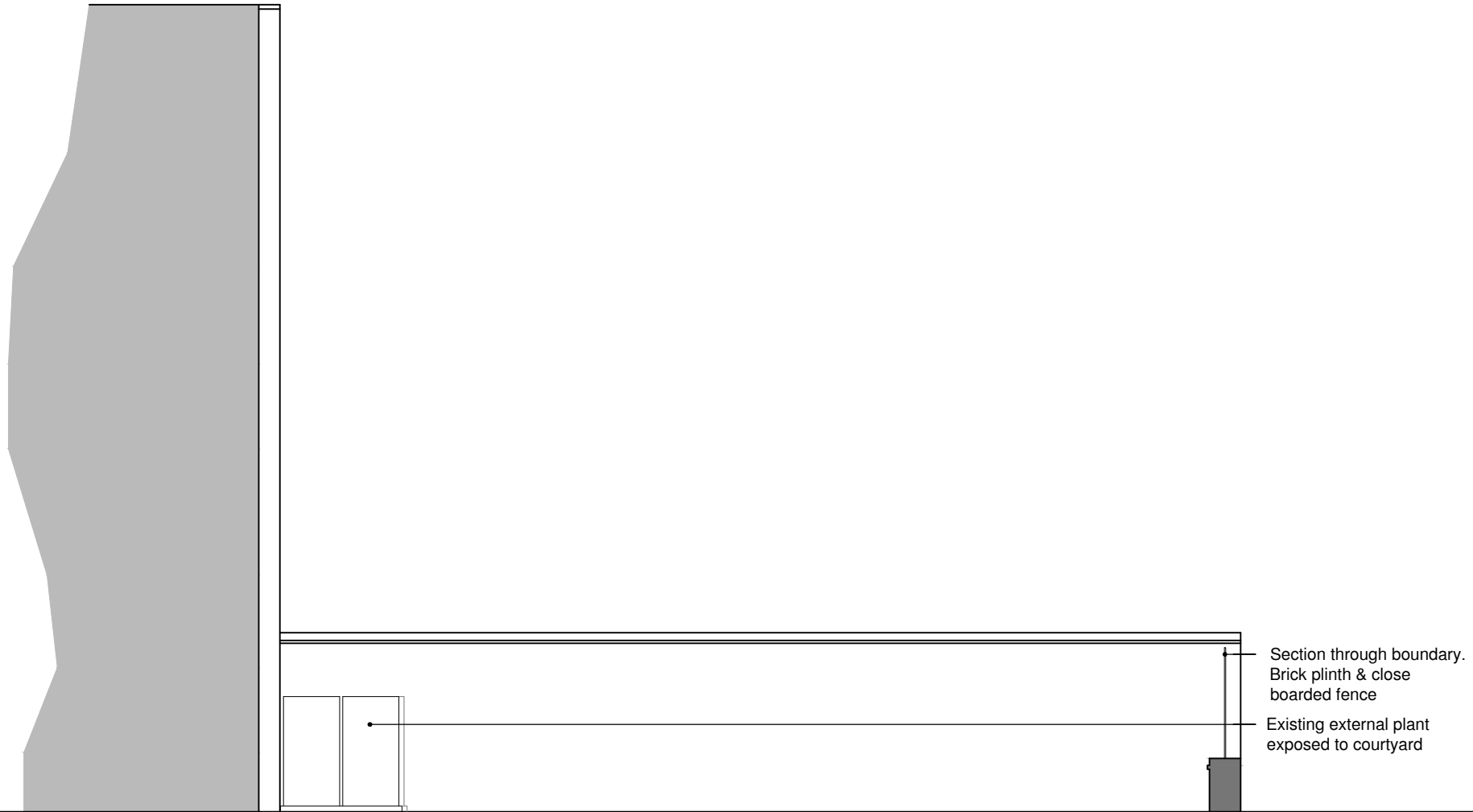
Northumberland House, 303-306 High Holborn, WC1V 7JZ EXISTING SOUTH ELEVATION (COURTYARD)

General Note. These drawings and notes do not constitute a full specification. They are for general guidance only and should not be scaled.