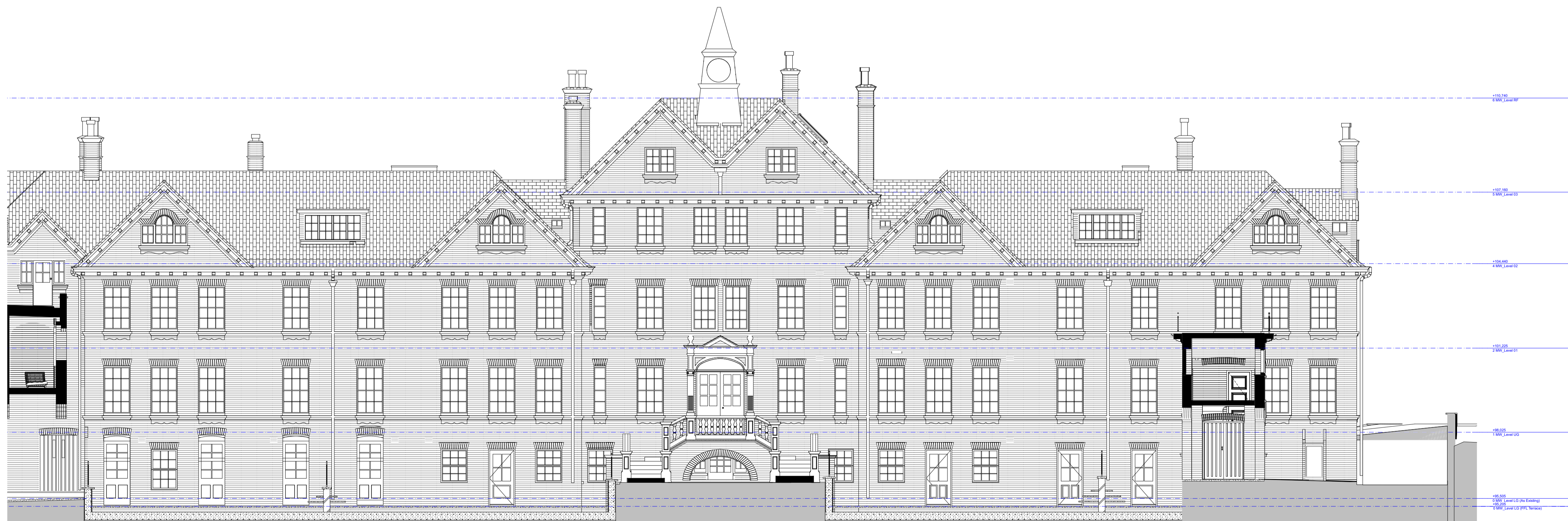
EL 1 EAST ELEVATION WITHIN LIGHTWELL