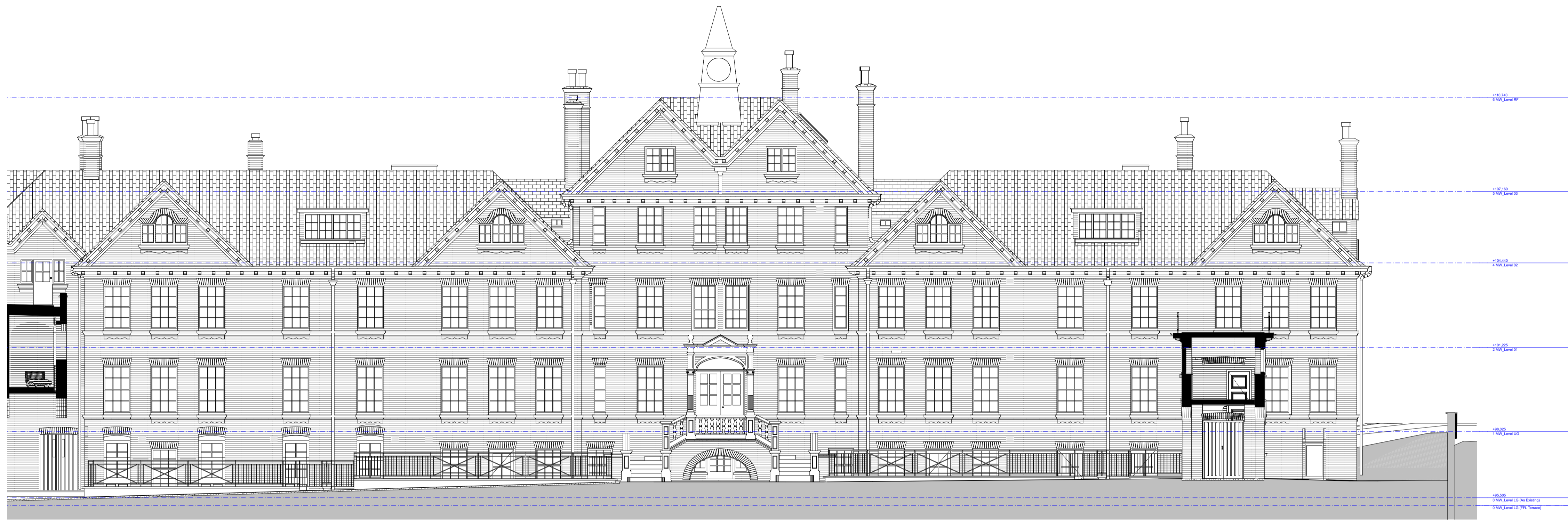
EL1 EAST ELEVATION