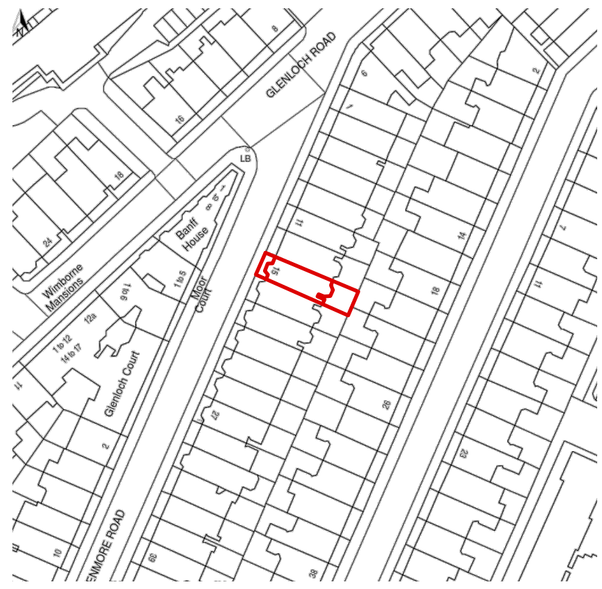
LOCATION PLAN SCALE: 1:1250 02

© LONDON DESIGN OFFICE 2015 All rights reserved, including but not limited to The Copyright, Designs and Patents Act 1988