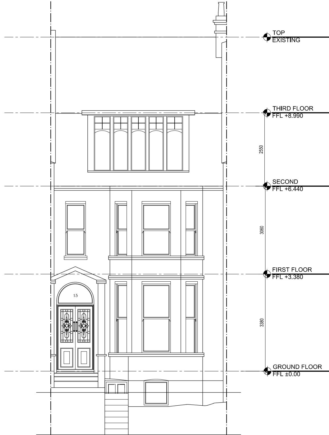
EXISTING FRONT ELEVATION SCALE: 1:75