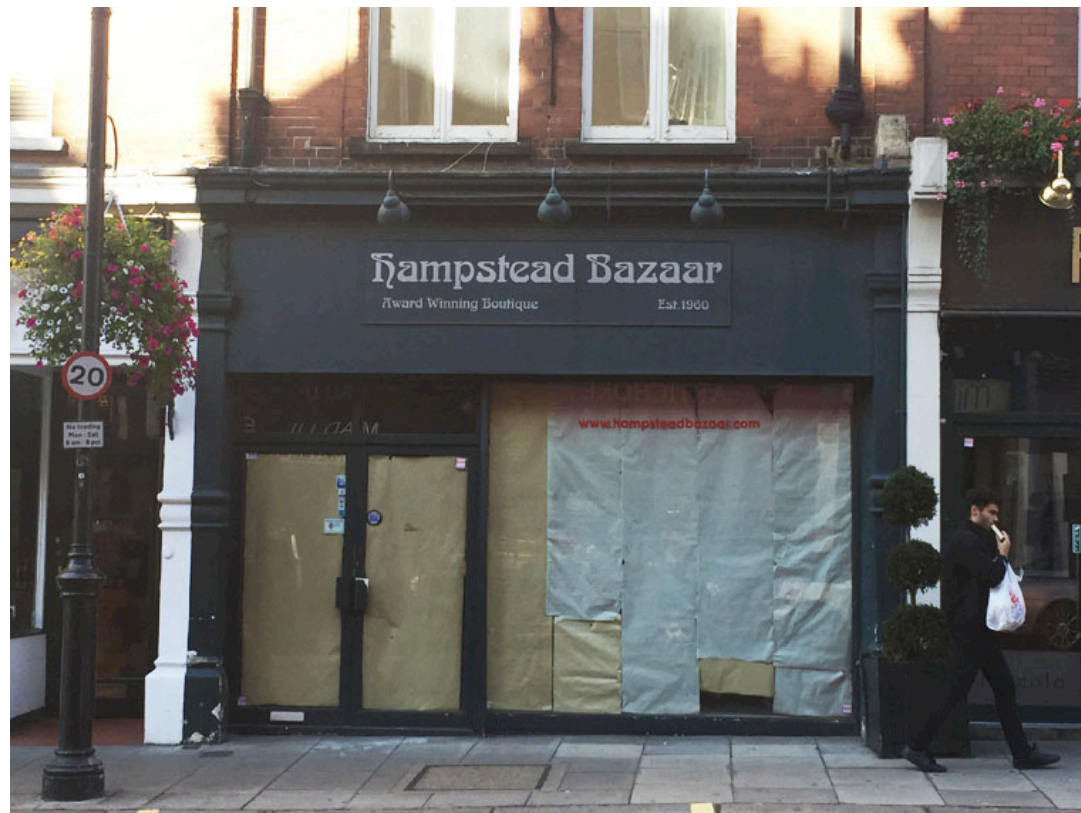
Photo of Existing Shopfront Elevation

Note: All dimensions to be checked by main contractor before manufacture or commencement on site