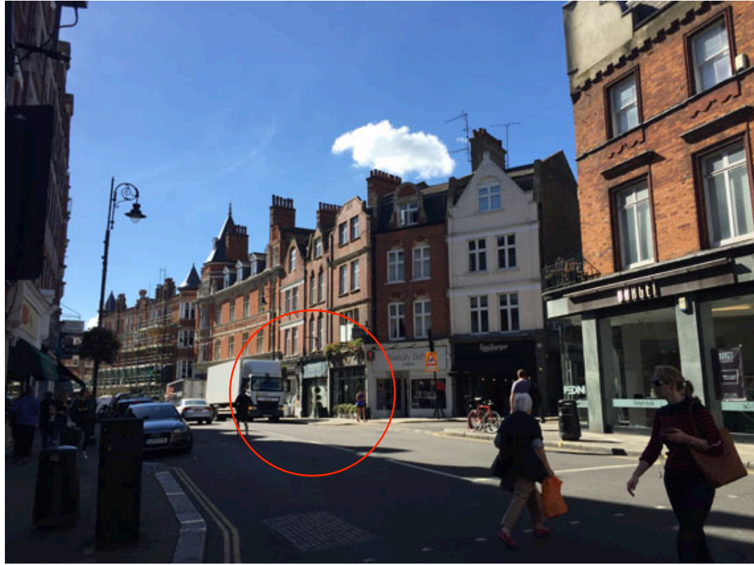
Heath Street, Hampstead