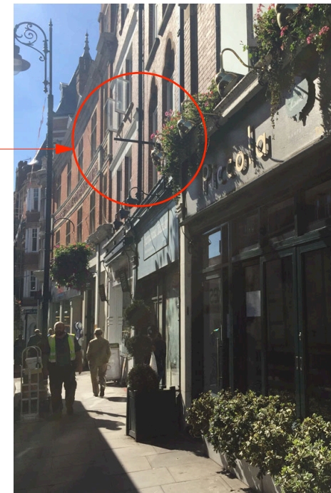
Shop front Plan