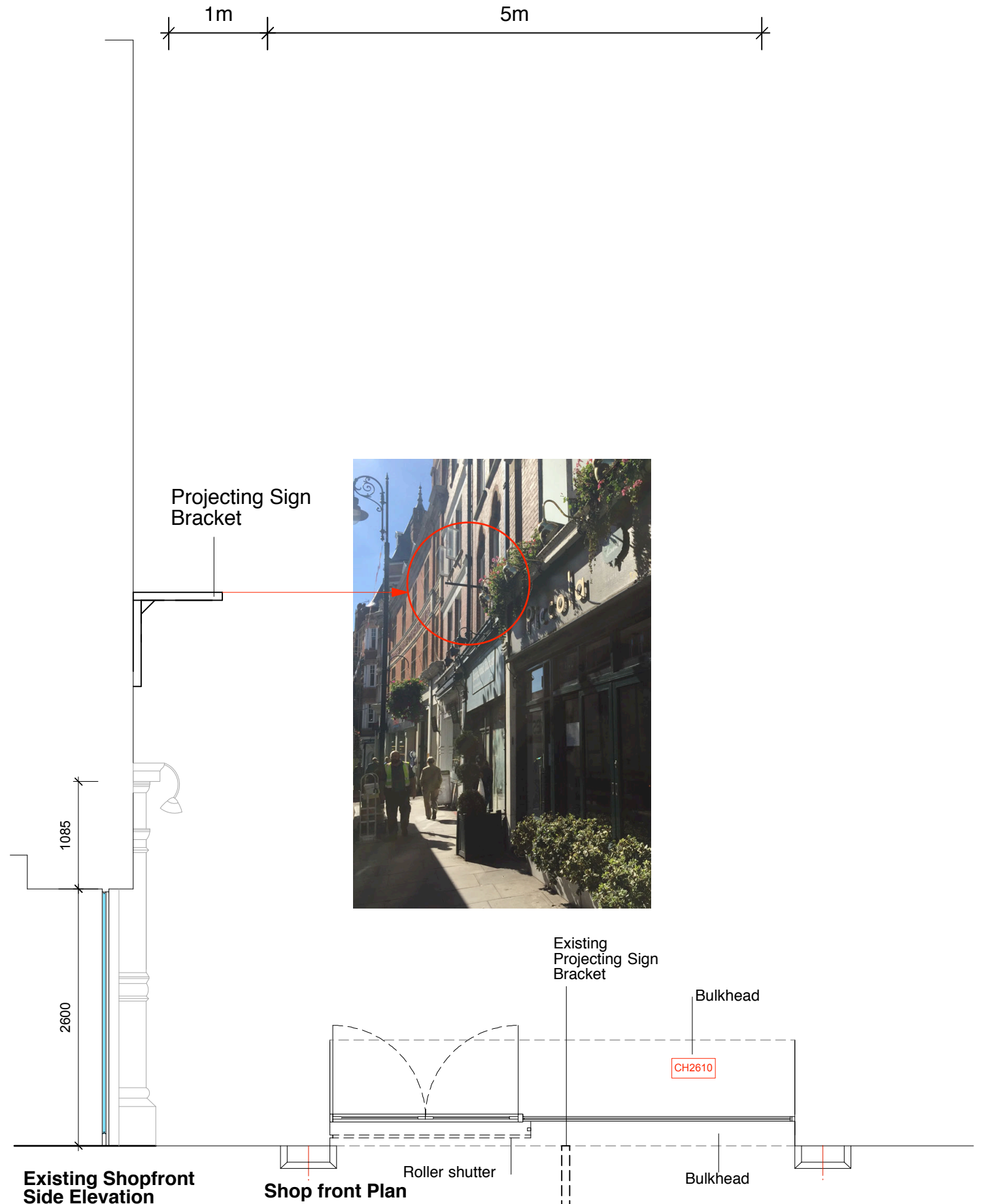
Existing Shopfront Side Elevation