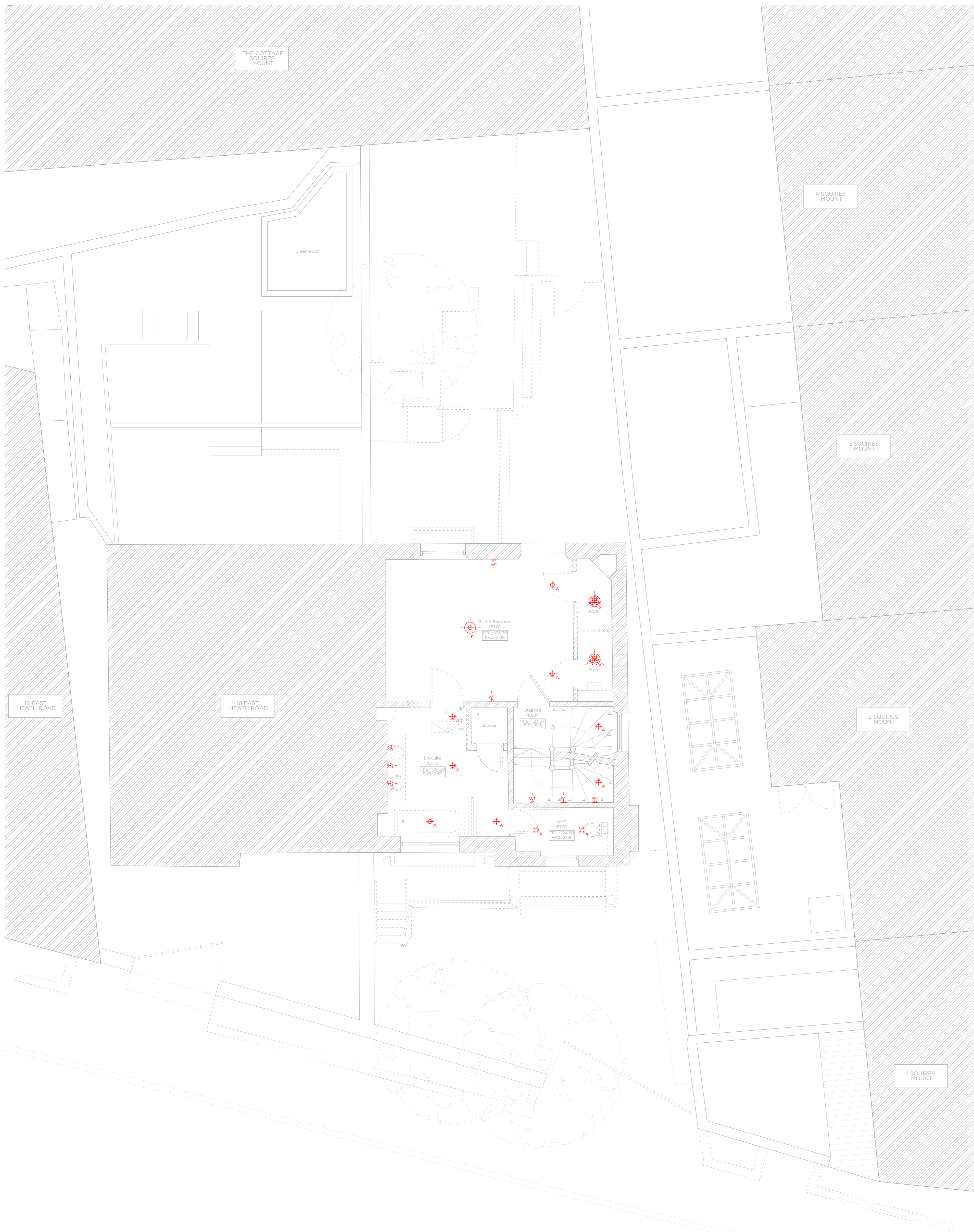
Demolition First Floor RCP