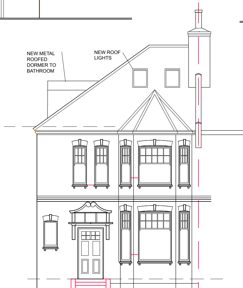
MINSTER ROAD ELEVATION Scale 1:100@A3