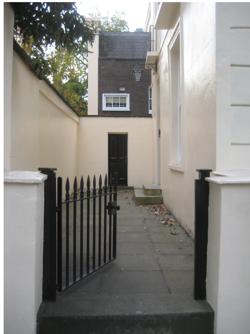
View 4: Access courtyard to side of 197 Albany street