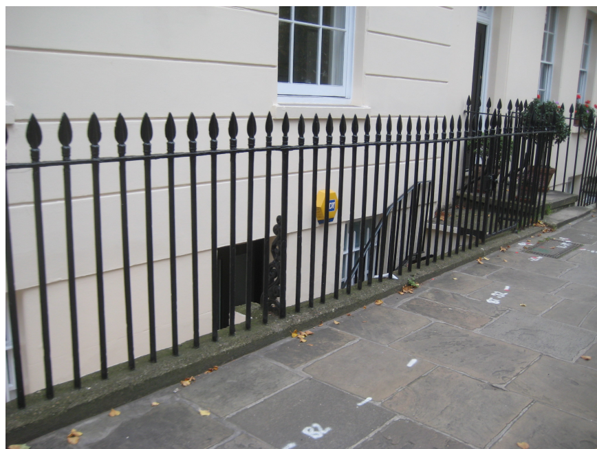
View 3: Lightwell to front of 197 Albany street