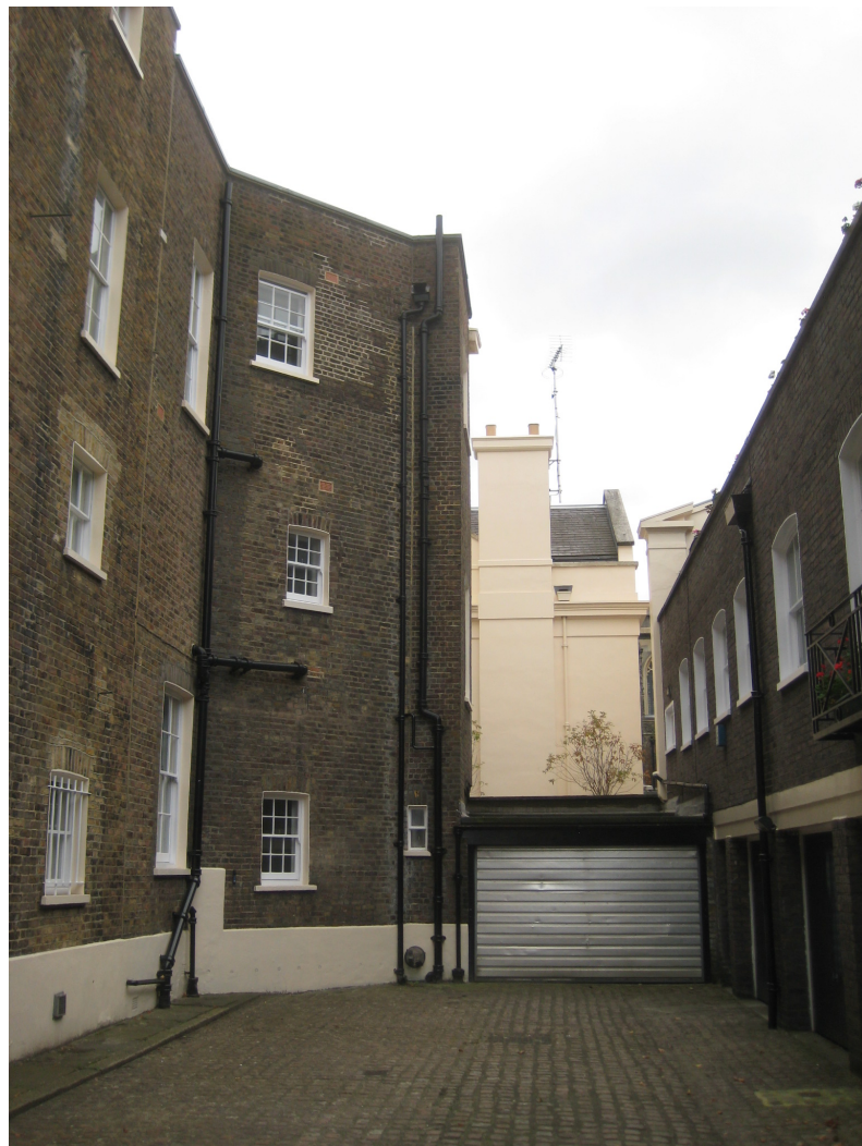
View 1: Garage view from Gloucester Mews