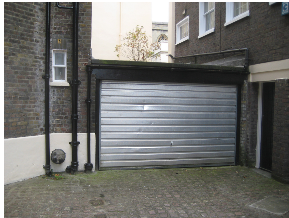
View 2: Garage of 197 Albany Street