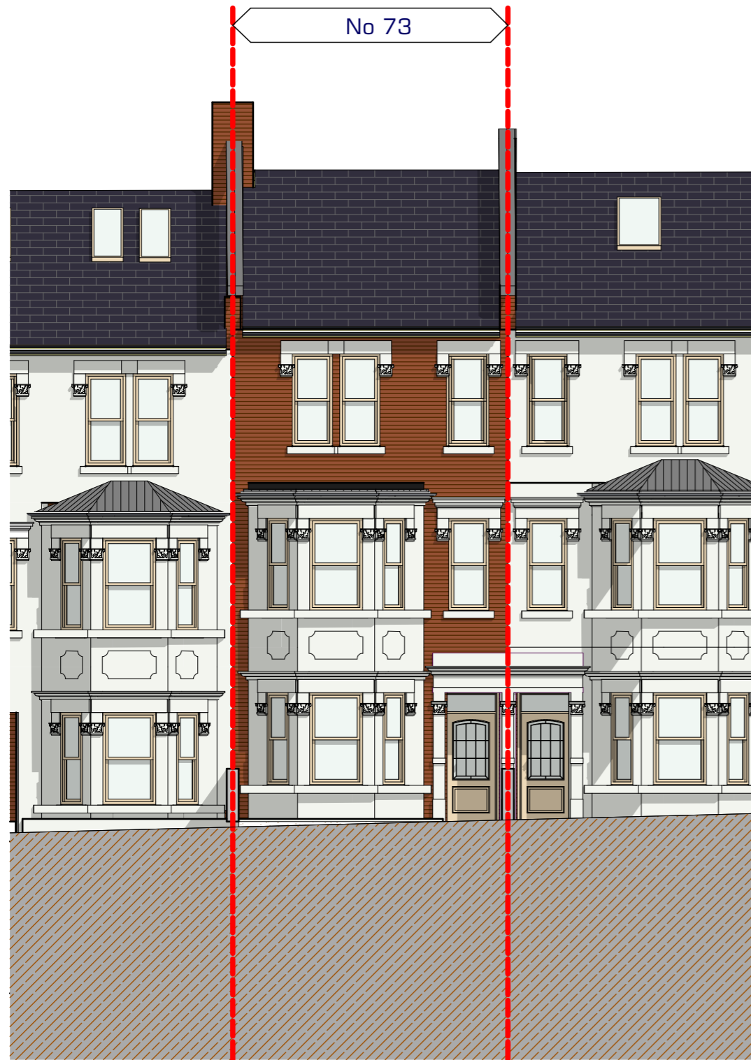
front elevation scale 1:100