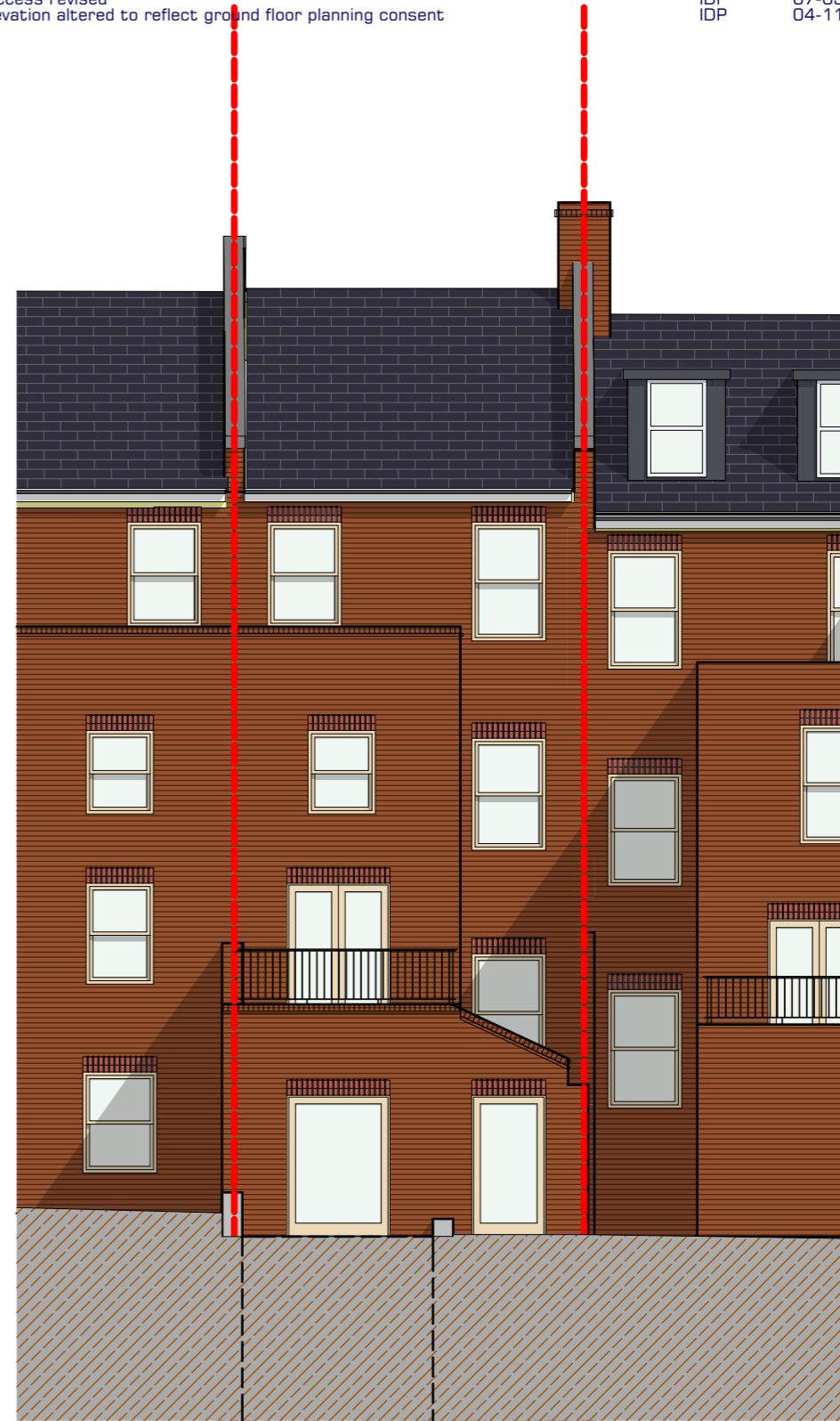
rear elevation scale 1:100