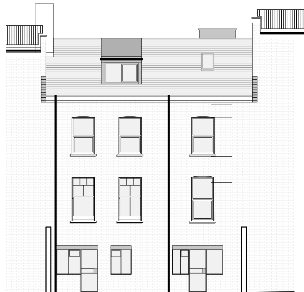
1 020 Existing rear elevation scale 1:100