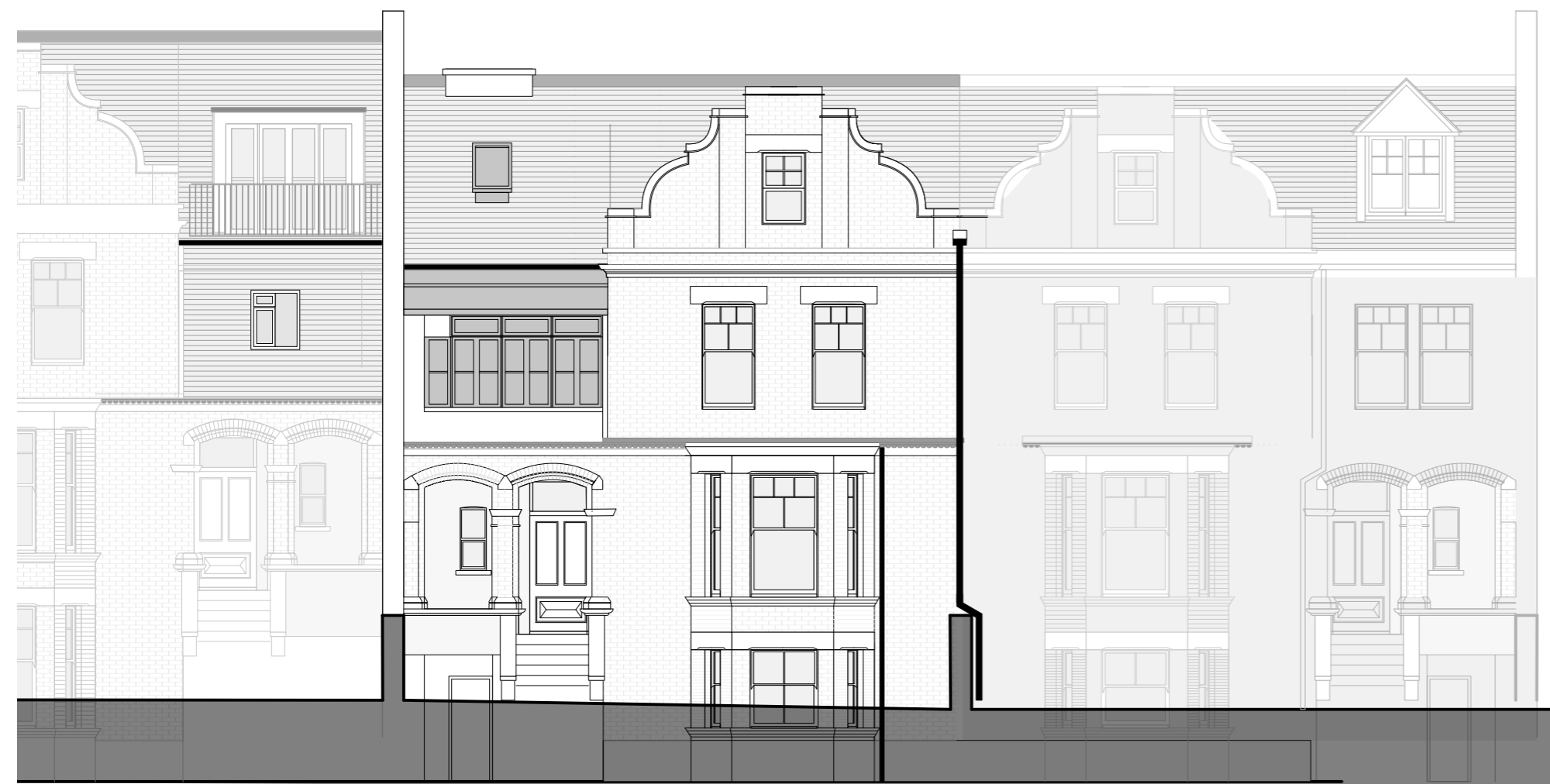
1 020 Existing front elevation scale 1:100