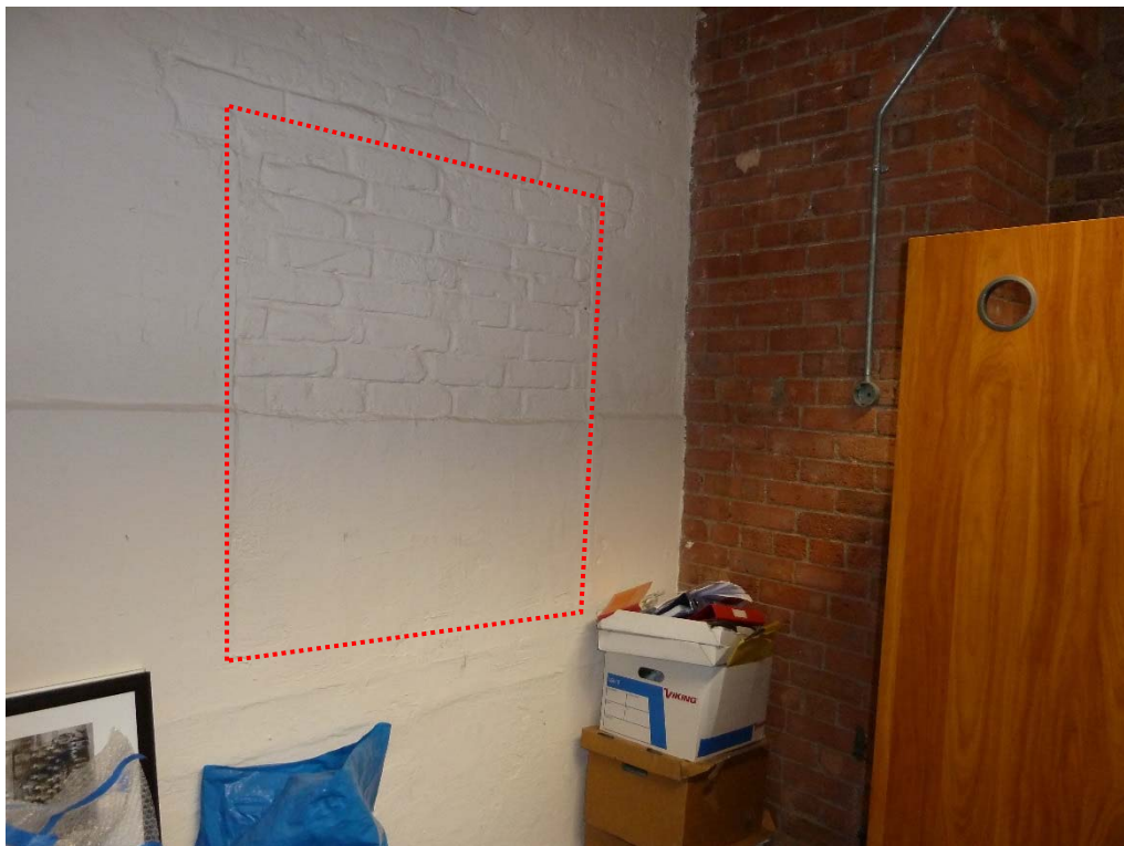
(Dotted area is approximate location of window).