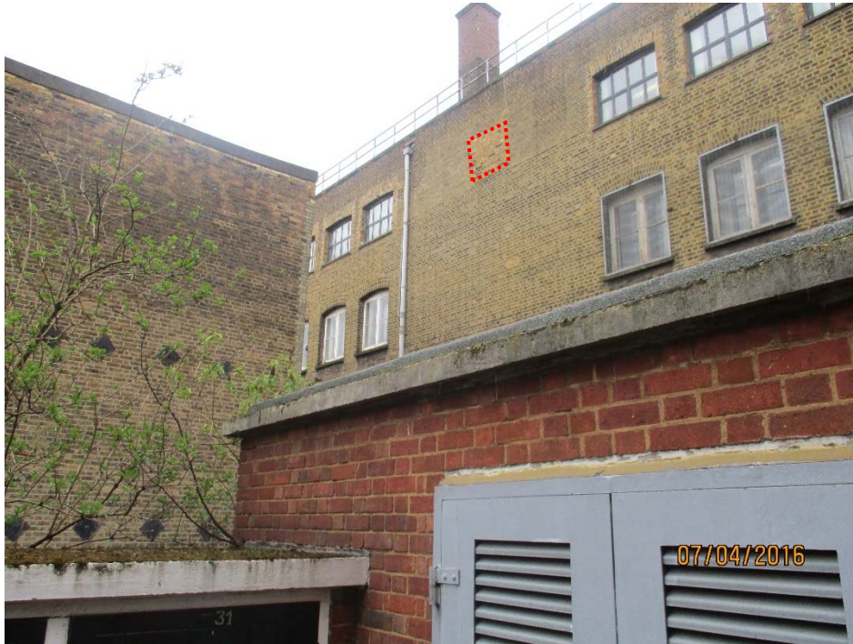
(Dotted area is approximate location of window).