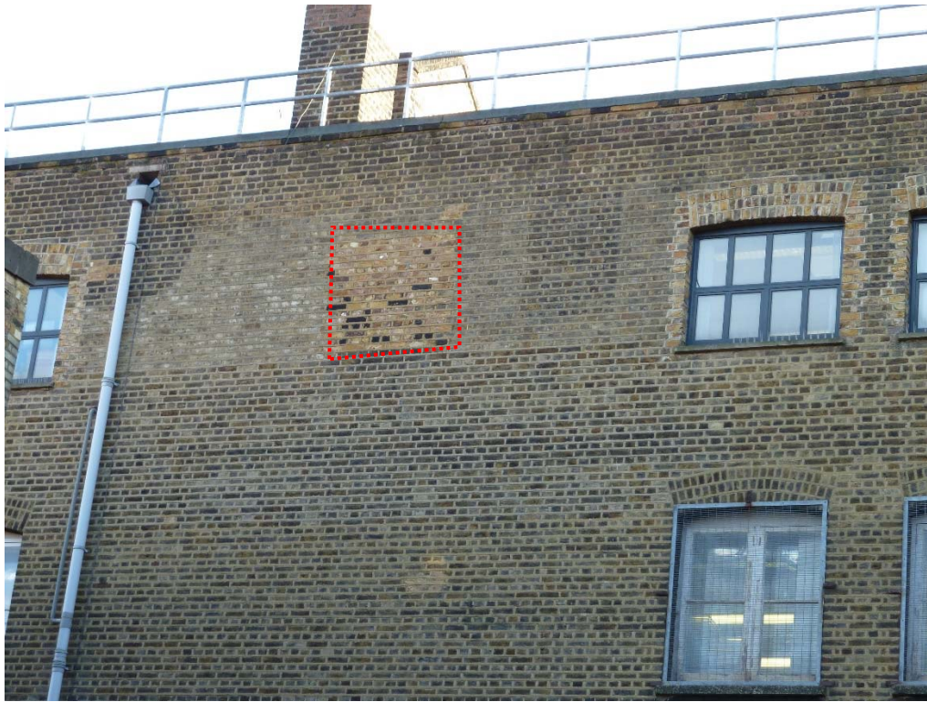
(Dotted area is approximate location of window).