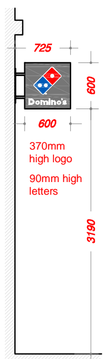
PROJECTING SIGN FIXATION