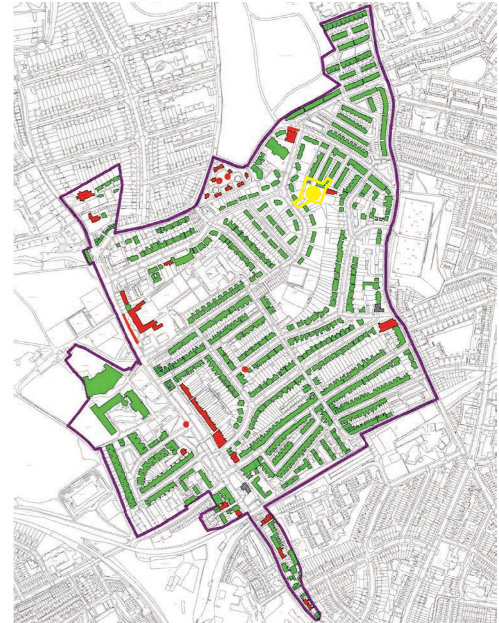
Dartmouth Park Townscape Appraisal Map