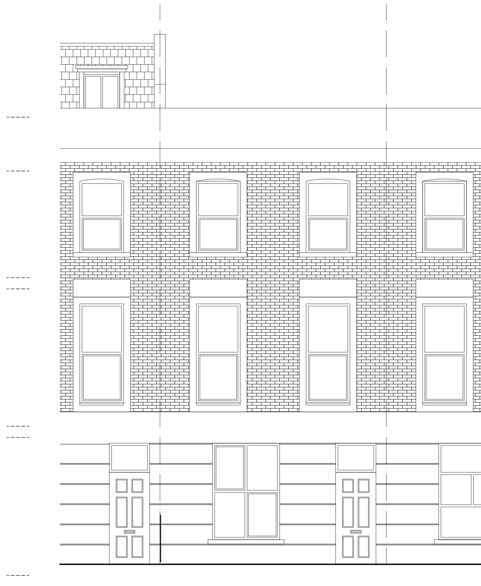
Existing Front Elevation Scale 1:50