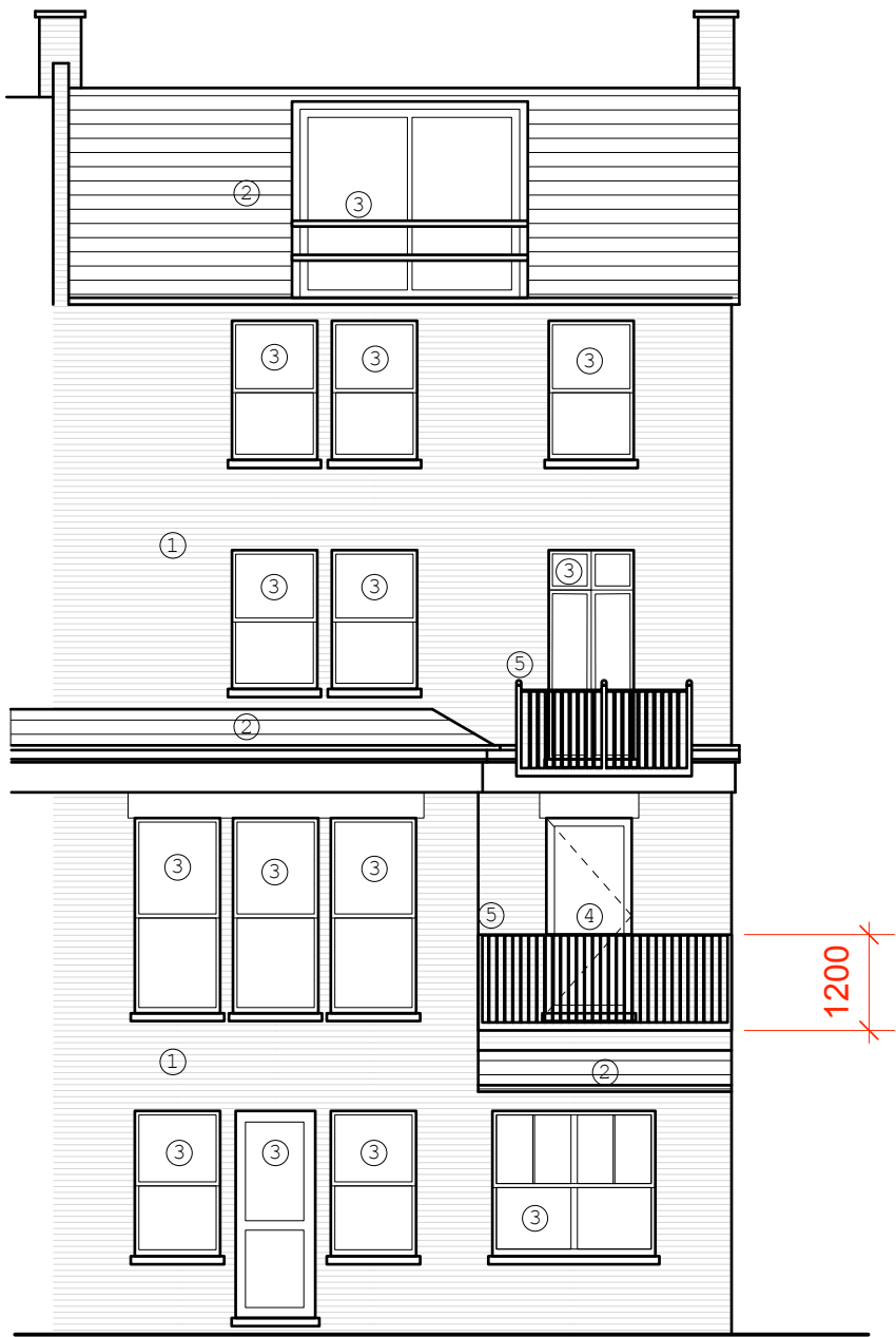
1 Rear elevation existing Scale: 1:100