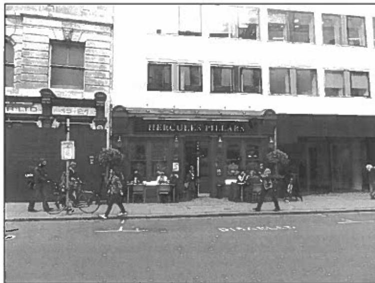
PHOTOGRAPH - B