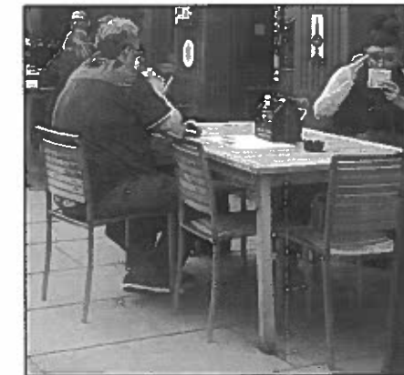
STYLE OF FURNITURE