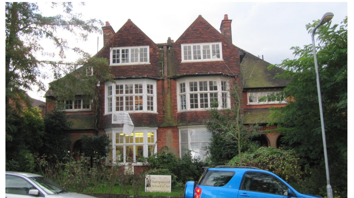
Figure 27 Typical semi-detached former dwellings within the Redington Froggnal Conservation Area.