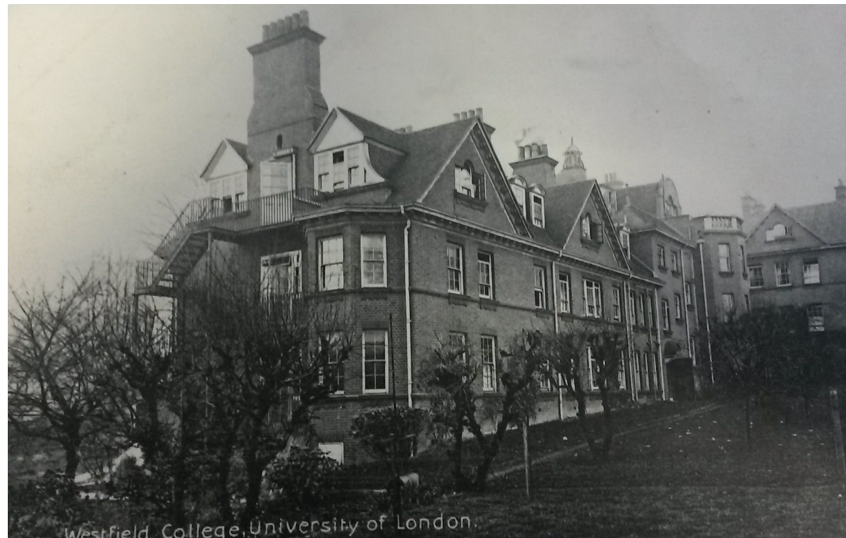
Figure 31. A postcard image of the rear of Dudin Brown Hall c. 1905. The former Orchard can be seen in this image.