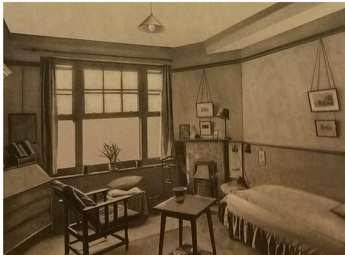
Figure 32. A photograph of a former student's room in Dudin Brown.