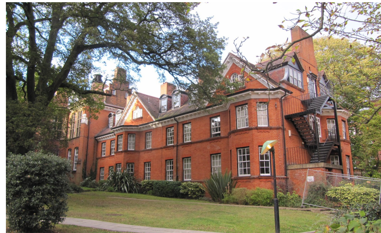
Figure 30 A photograph of the principal elevation of Dudin Brown as seen from Kidderpore Avenue.