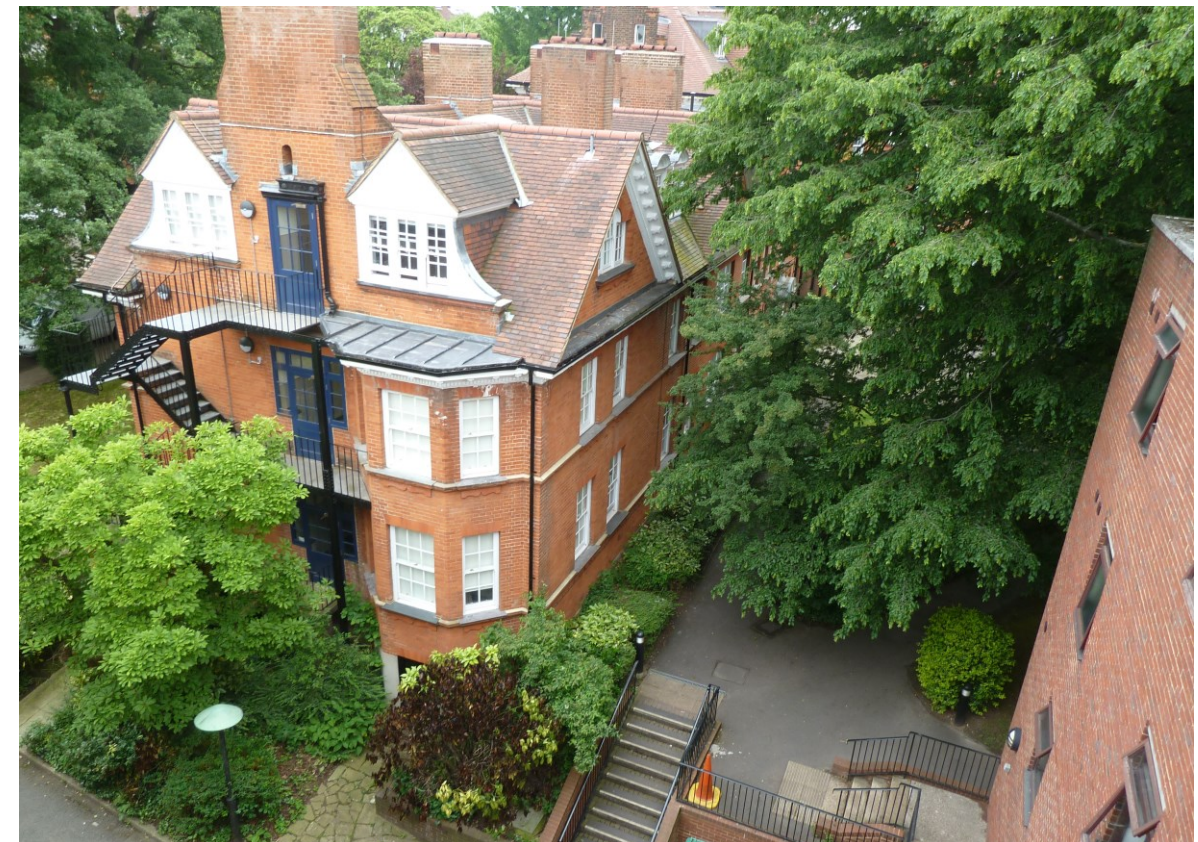
Figure 34 An aerial view of the rear elevation of Dudin Brown taken from Rosalind Franklin Hall.