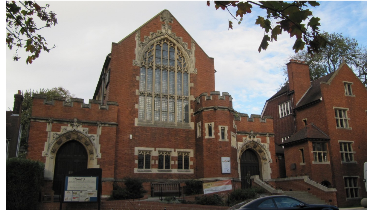
Figure 26 A photograph of the Grade II* listed Church at St Luke's which is situated to the west of the application site. The Grade II listed Vicarage is seen to the right of this photograph.

Hall is described as 'the remaining section of John Teil's landscaped garden with which the original summerhouse remains.' The summerhouse and the Chapel are identified as being 'in poor condition.'