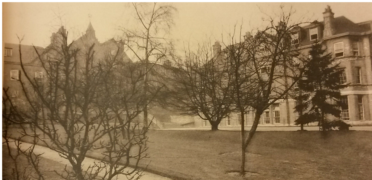
Figure 35 An image of the Maynard Wing and Lady Chapman Hall from the south looking northeast c.1929.