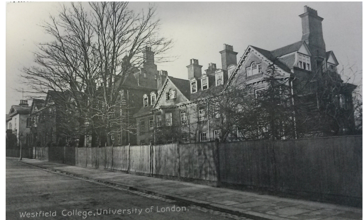
Figure 29. An early photograph of Dudin Brown as seen from Kidderpore Avenue looking north, with Kidderpore Hall seen in the background.