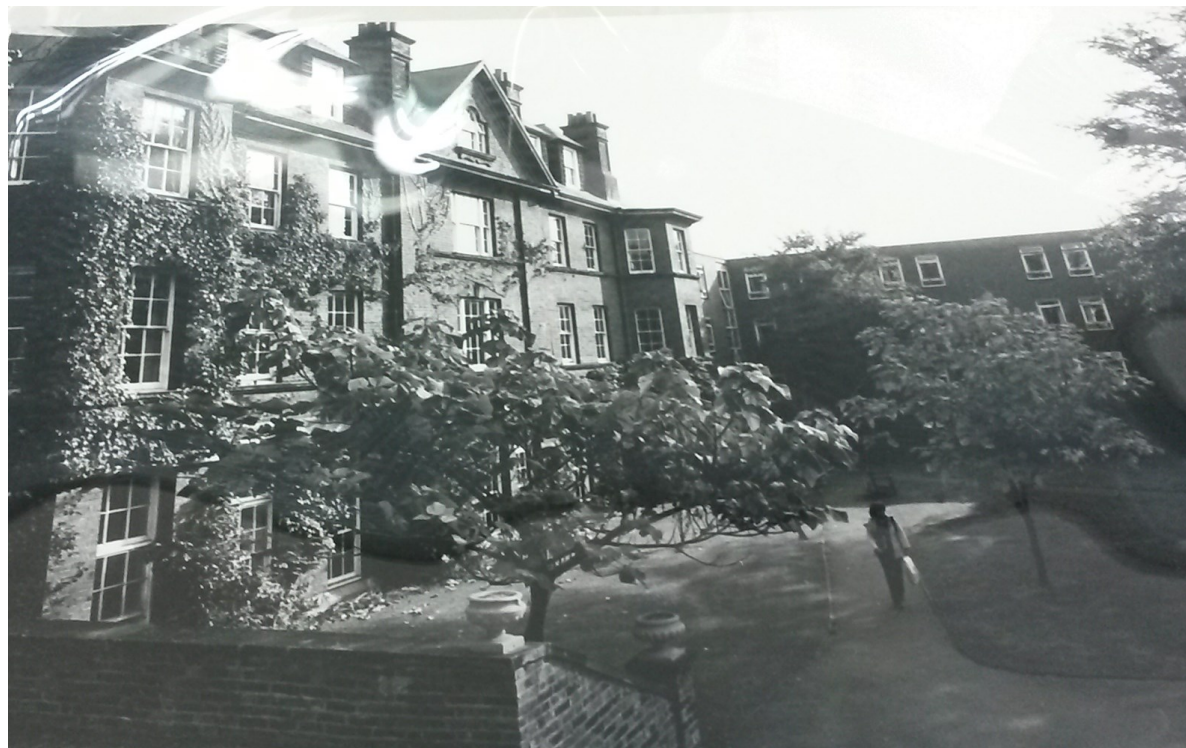
Figure 37 A photograph of Lady Chapman Hall and Rosalind Franklin as seen from the cobbled walkway fronting Maynard in 1962.