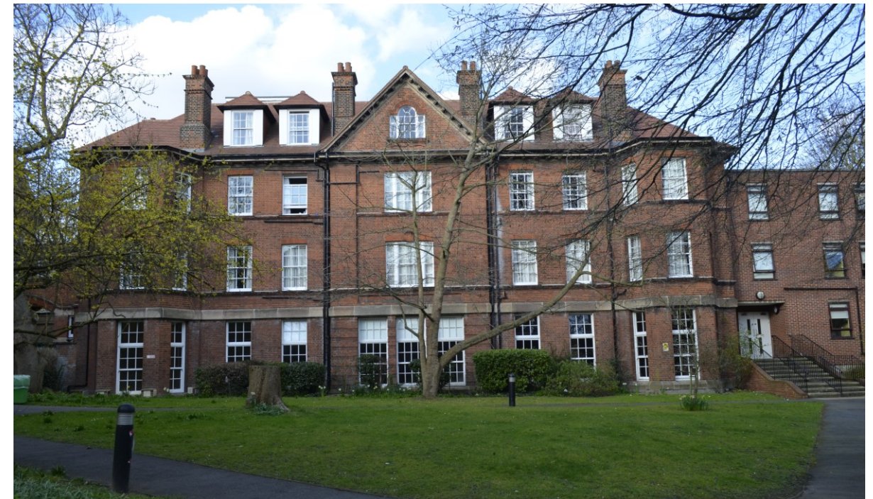
Figure 39. The principal elevation of Lady Chapman Hall as seen from within the eastern courtyard looking north. Rosalind Franklin Hall can be seen abutting the building to the right of this photograph.