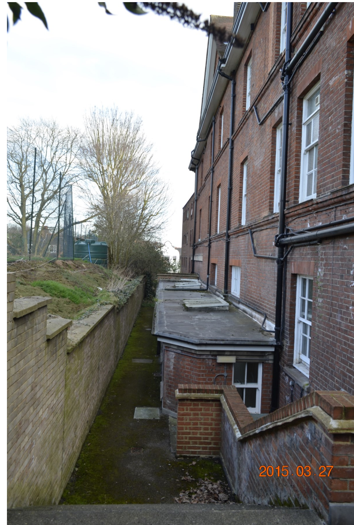
Figure 36 The boundary wall to the north of the site and the rear elevation of Lady Chapman Hall.