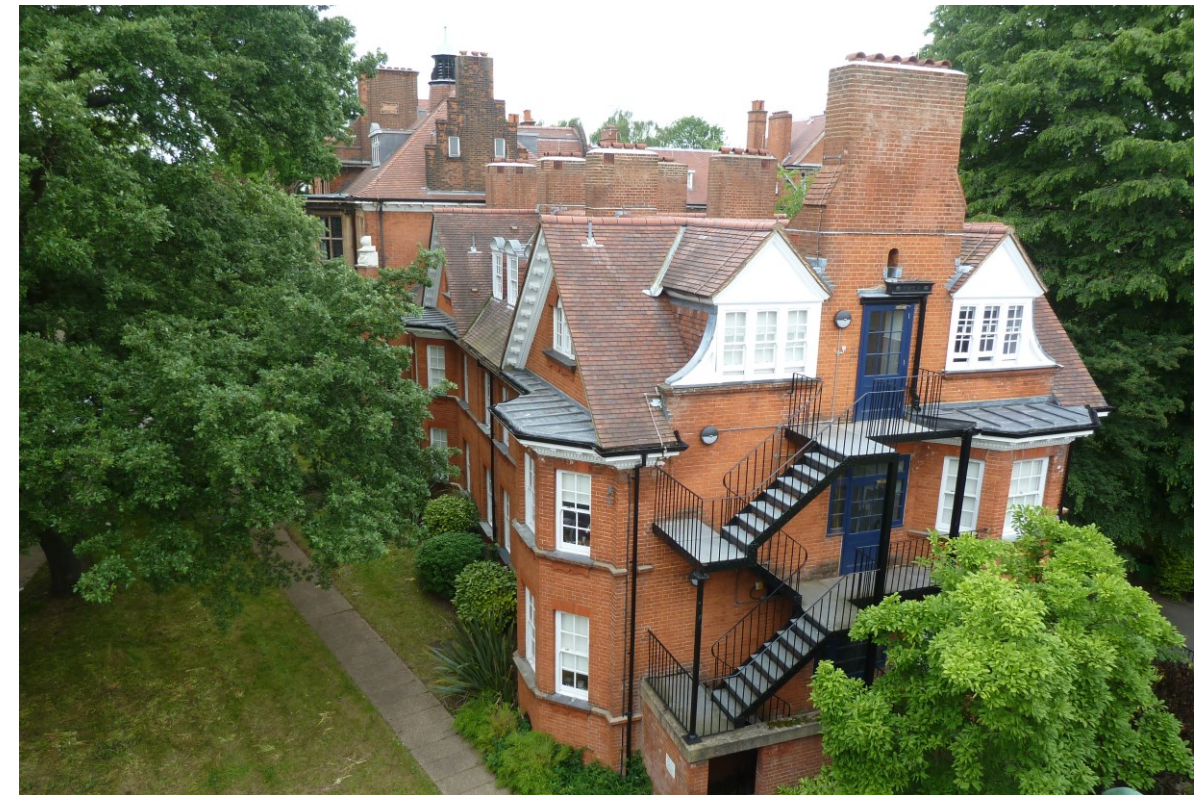
Figure 33 An aerial view showing the later addition of the fire escape staircase.