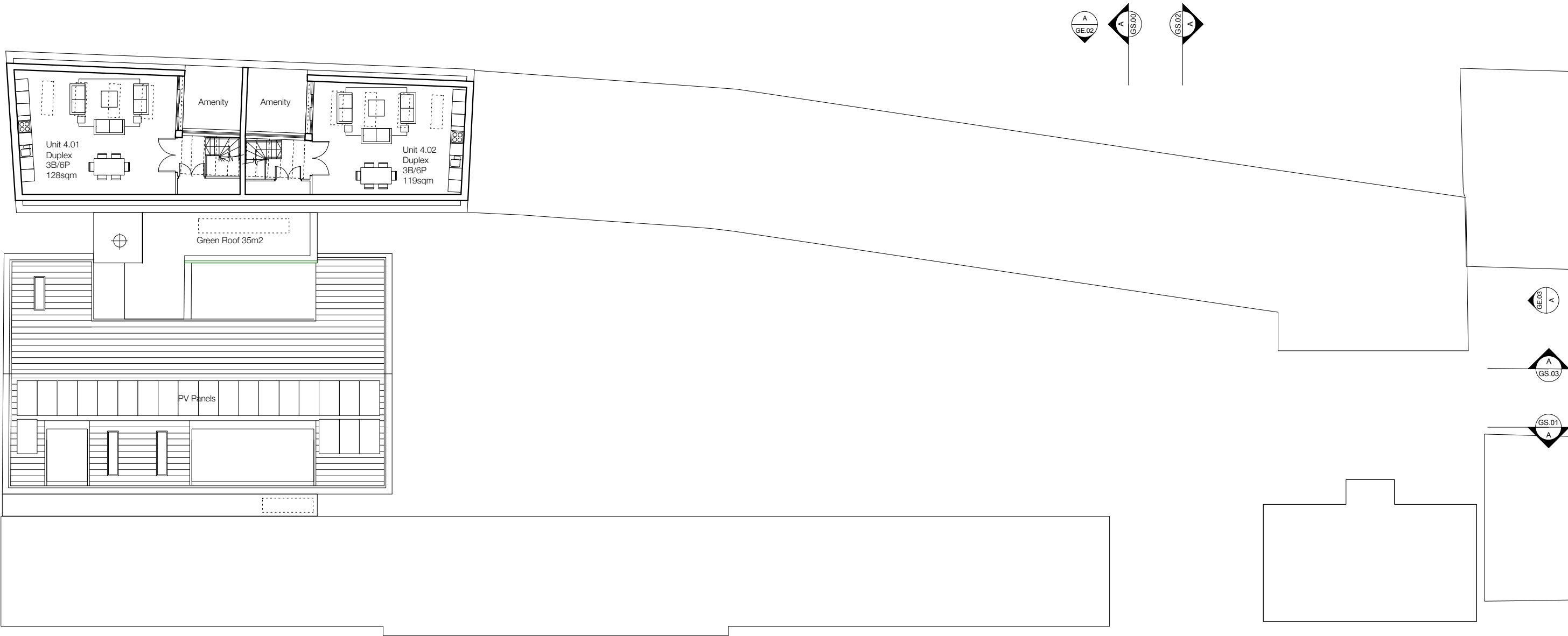
A Proposed Fifth Floor General arrangement GA.05 1:100 @A1 1:200 @A3