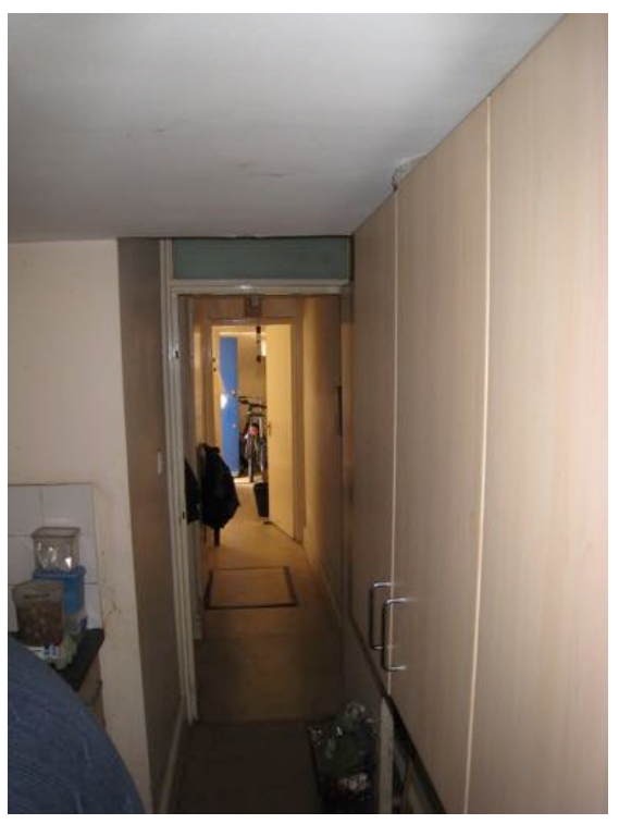
kitchen - view towards front area