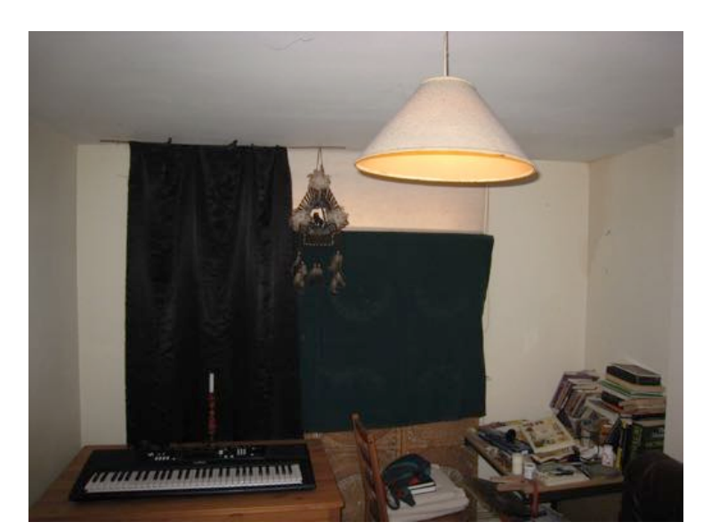
bedroom (rear room)