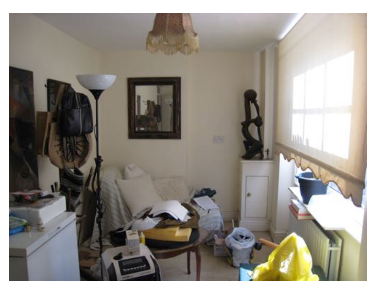
living room (front room)