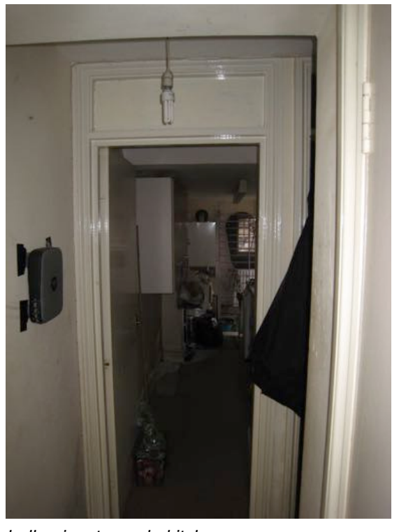
hall - view towards kitchen