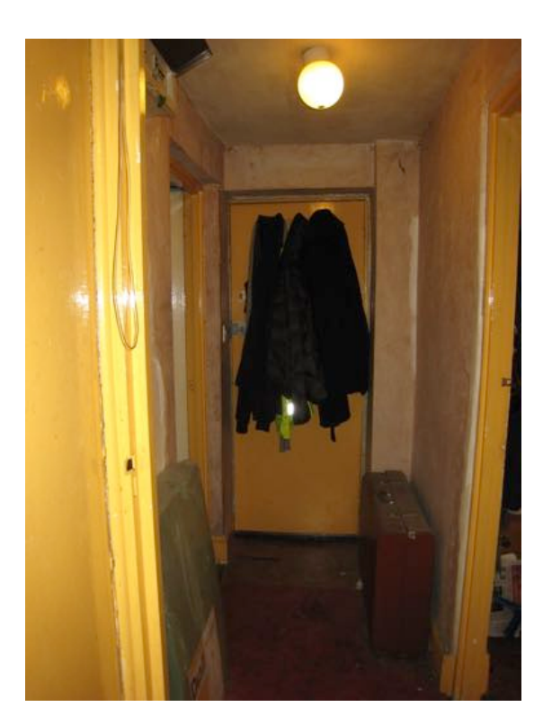
hall - view towards flat entrance