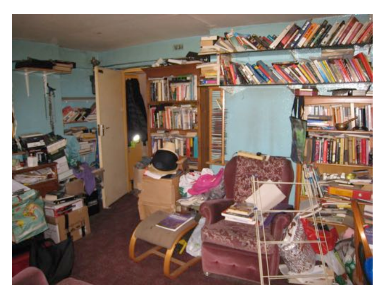
living room (rear room)