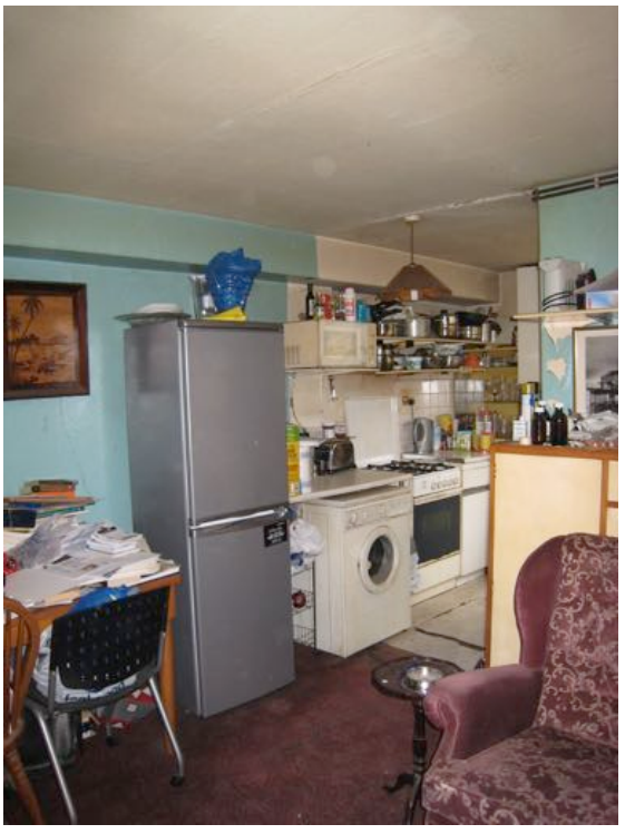
living room - view towards kitchen