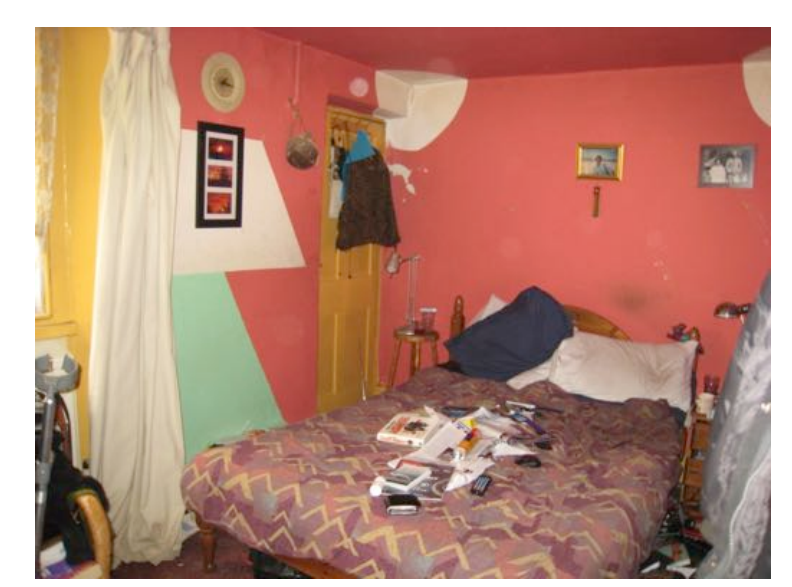
bedroom (front room)