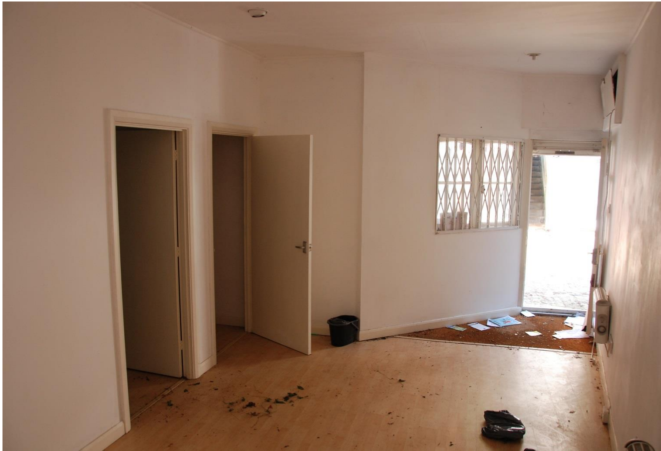
Photograph 3: Interior of Ground Floor Unit