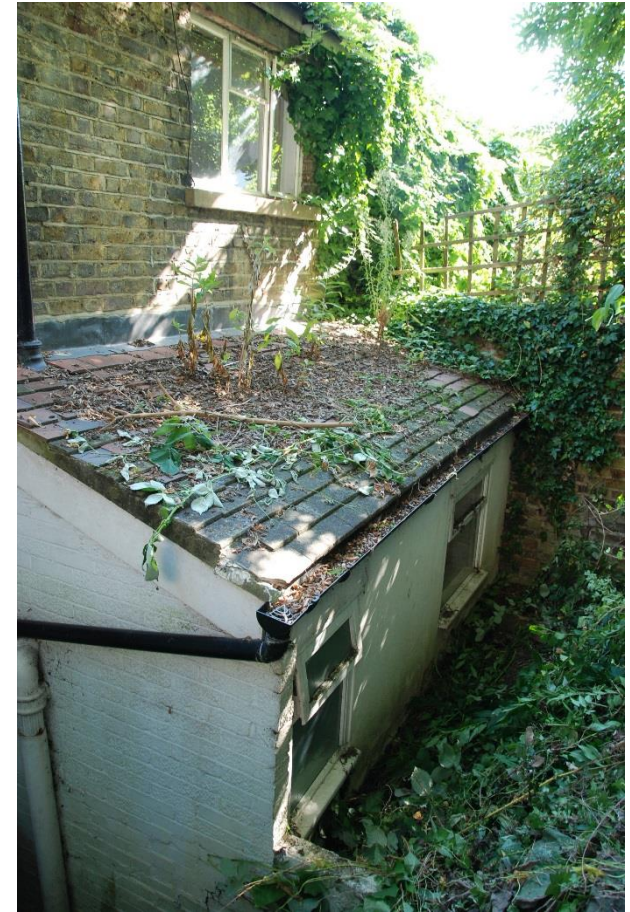
Photograph 7: Rear addition at ground level