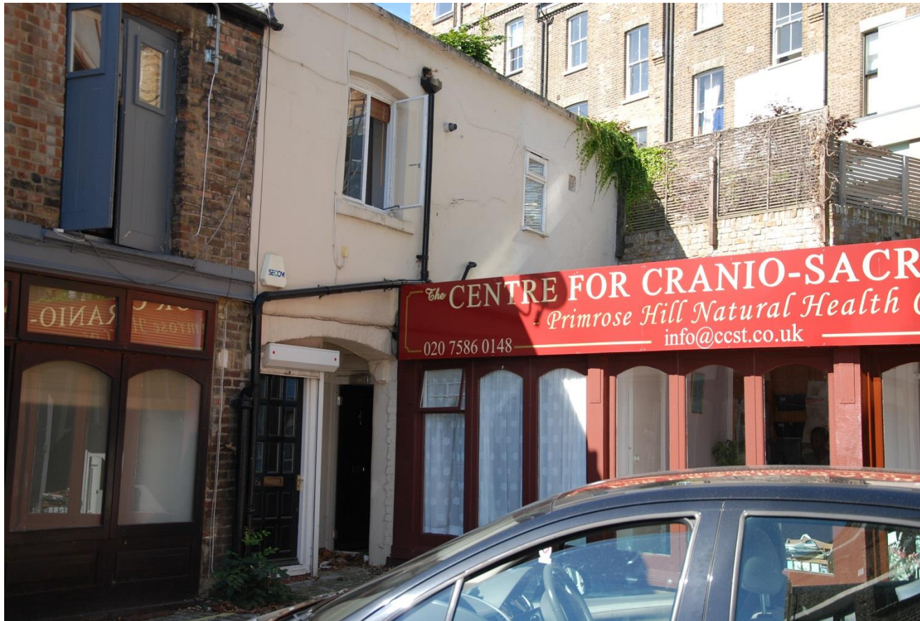
Photograph 1: Front elevation of 8/8a St George's Mews