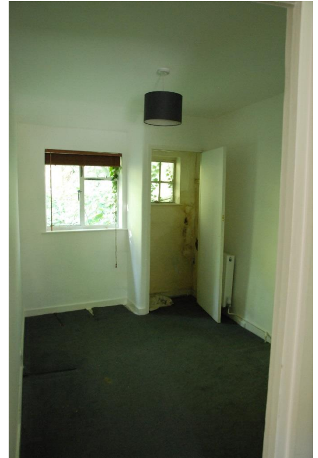
Photograph 4: Interior of First Floor Unit