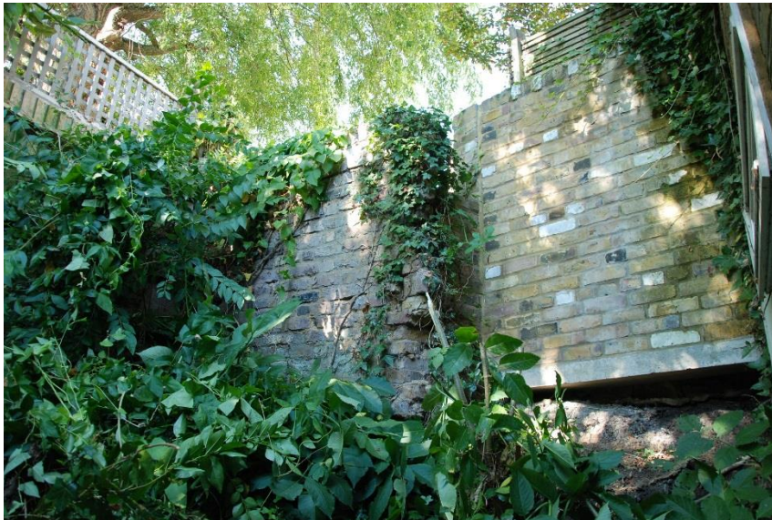
Photograph 6: Boundary wall/rear garden