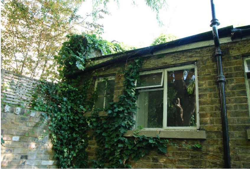
Photograph 5: Rear windows at first floor level