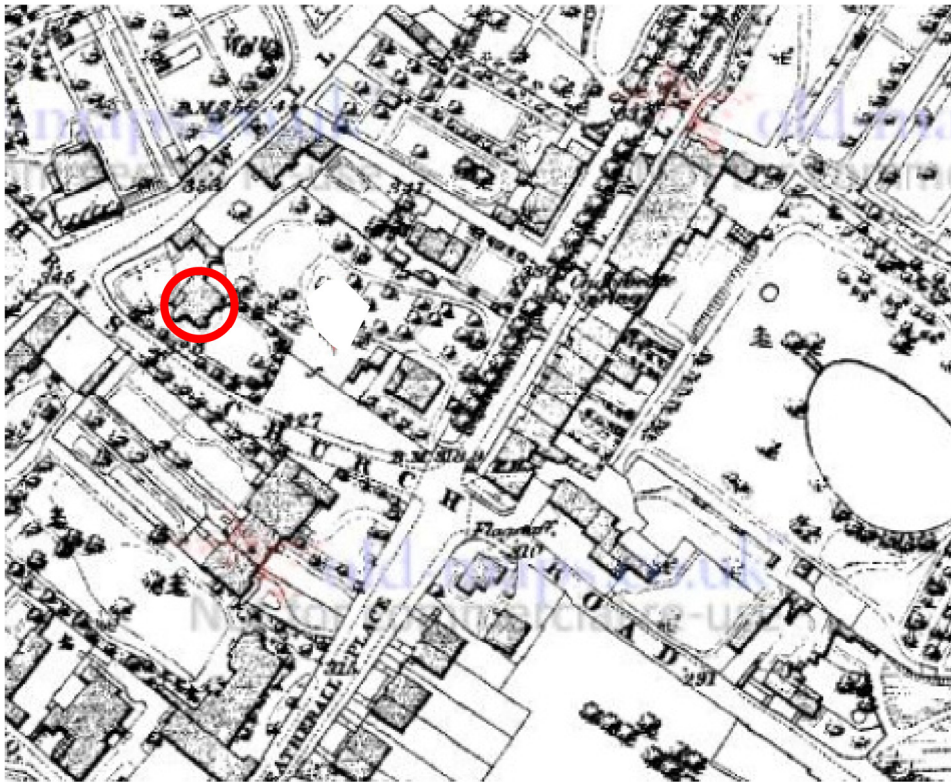
Map 2: Ordnance Survey Map Year 1879