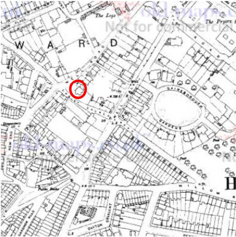
Map 4: Ordnance Survey Map Year 1915