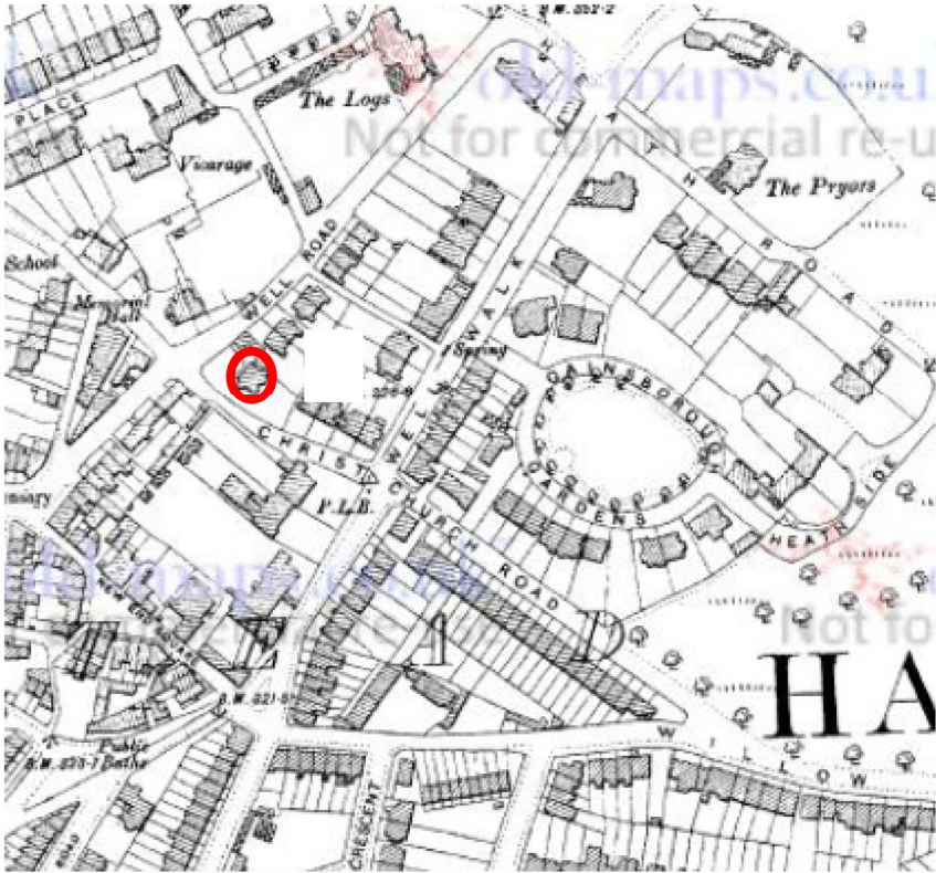
Map 3: Ordnance Survey Map Year 1896