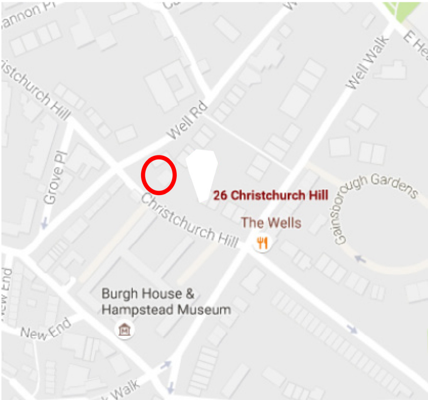
Map 1: Street Map