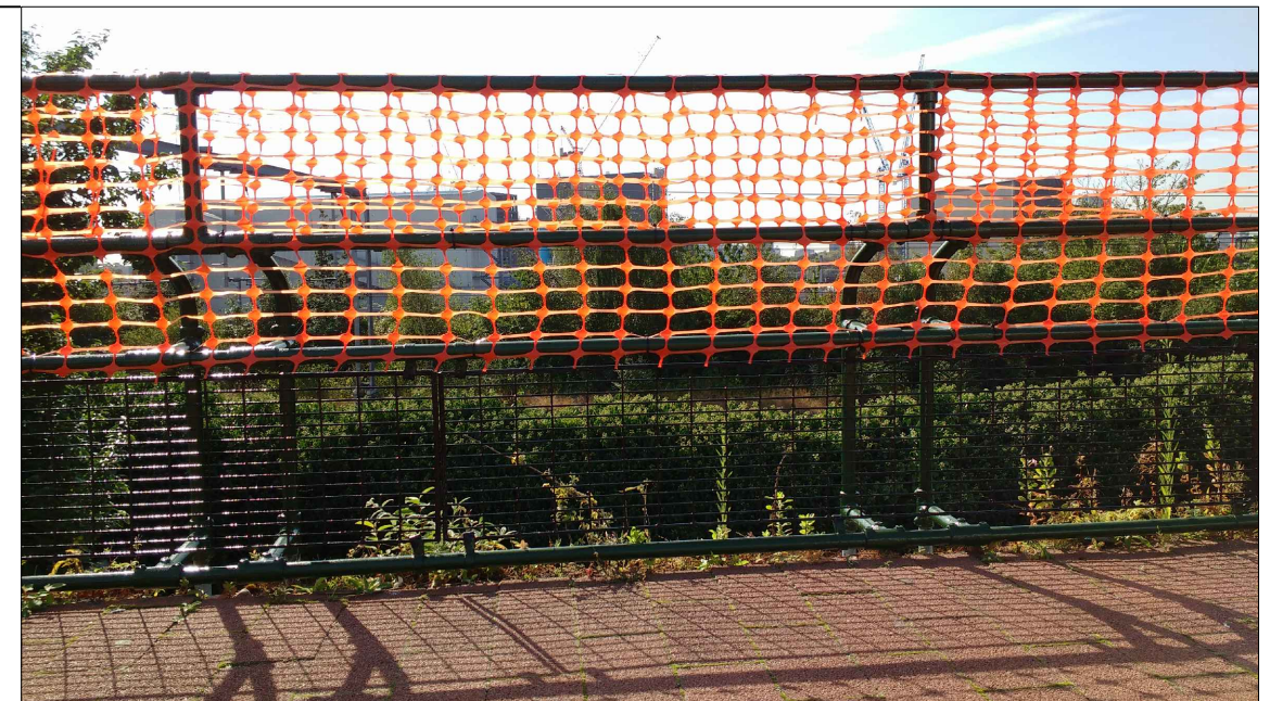
EXISTING KEY-CLAMP TYPE METAL TUBULAR GUARDING WITH MESH INFILL PANELS