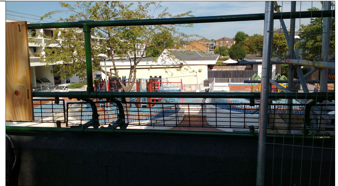
EXISTING KEY-CLAMP TYPE METAL TUBULAR GUARDING WITH MESH INFILL PANELS