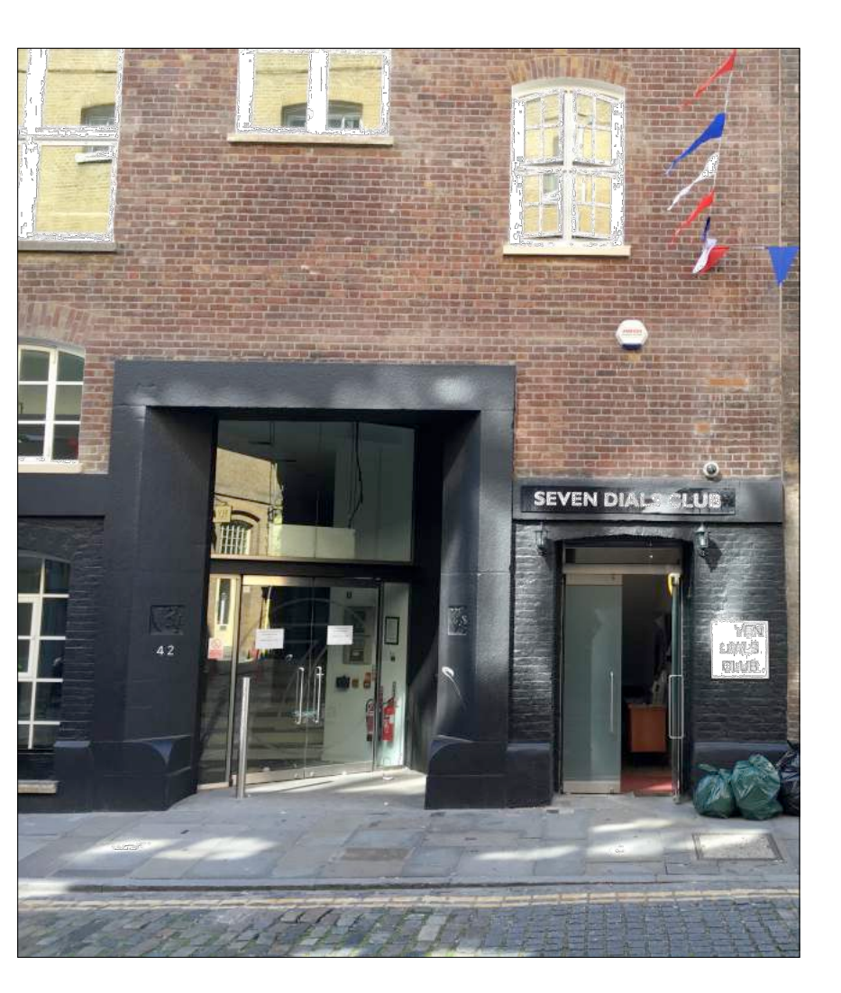
SEVEN DIALS WAREHOUSE ENTRANCE GLASS DOOR

Aluminium signboard fixed to existing facade. with black vinyl letters