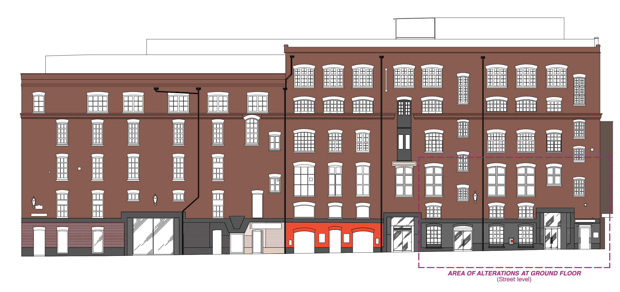
KEY ELEVATION (Scale 1:200)