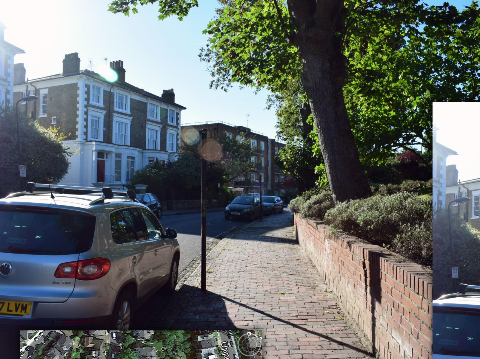
This Photograph shows as existing

Cell Site: CTIL 148391 Site Location: Troyes House Lawn Road Hampstead London NW3 2XT NGR: E 527575 N 185042