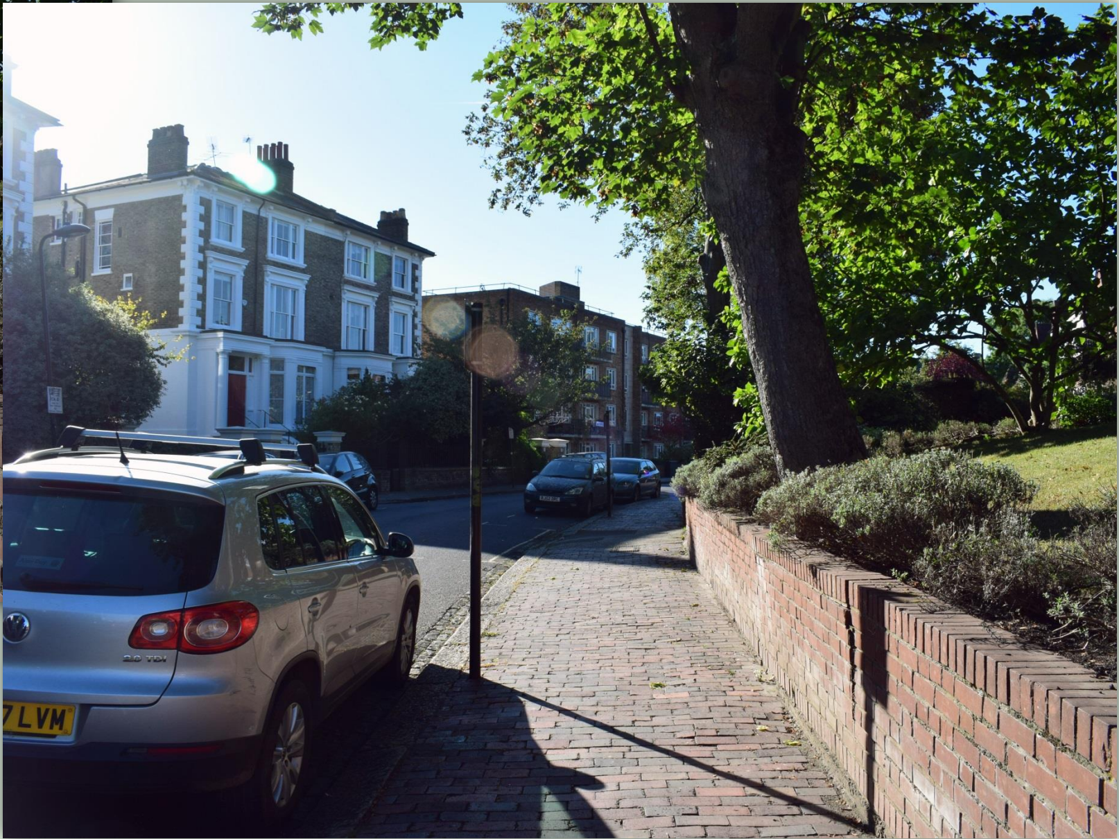
This Photomontage is for Illustrative Purposes Only