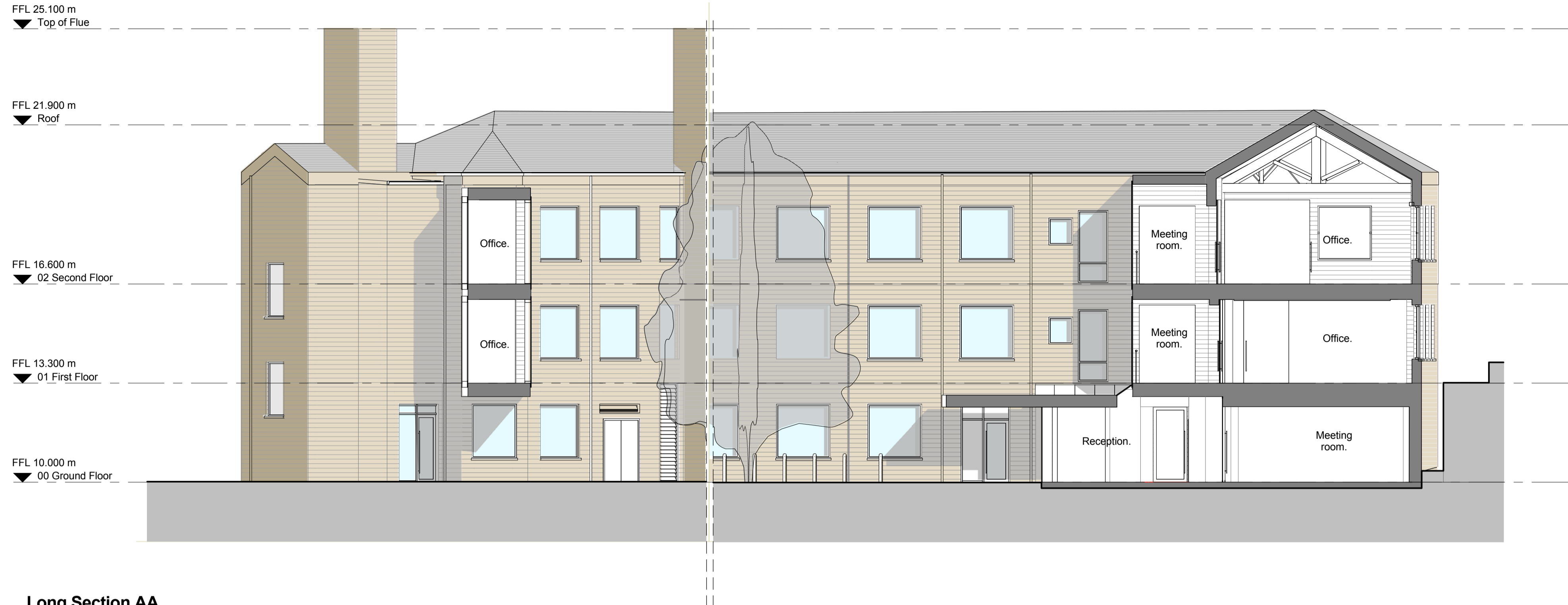
Long Section AA 1 : 100

AREA MEASUREMENT The areas are approximate and can only be verified by a detailed dimensional survey of the completed building. Any decisions to be made on the basis of these predictions, whether as to project viability, pre-letting, lease agreements or the like, should include due allowance for the increases and decreases inherent in the design development and building processes. Figures relate to the likely areas of the building at the current state of the design and using the Gross External Area (GEA) / Gross Internal Area (GIA) / Net Internal Area (NIA) method of measurement from the Code of Measuring Practice, 6th Edition (RICS Code of Practice). All areas are subject to Town Planning and Conservation Area Consent, and detailed Rights to Light analysis.