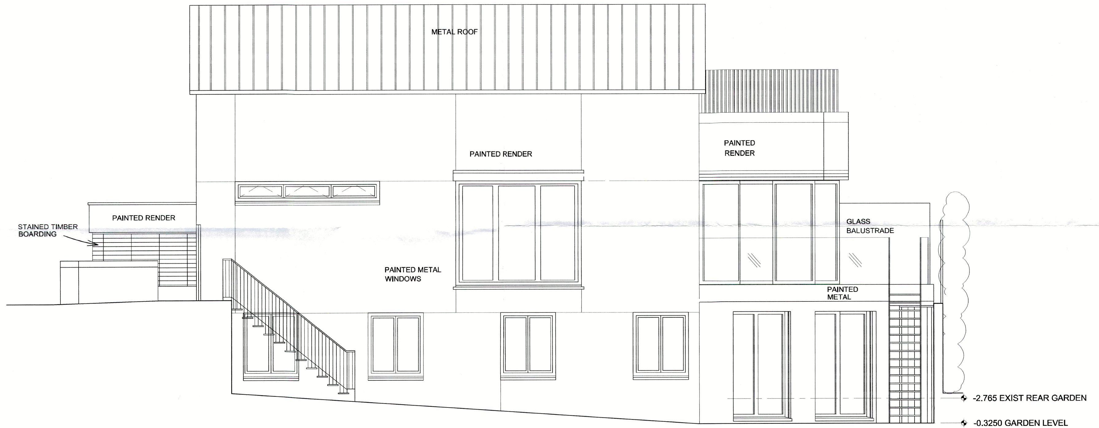
PROPOSED RIGHT SIDE ELEVATION