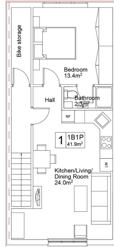
PROPOSED FIRST FLOOR

CLIENT GROSVENOR SQUARE ESTATES LTD 64 CANFIELD GARDENS LONDON NW6 3EB