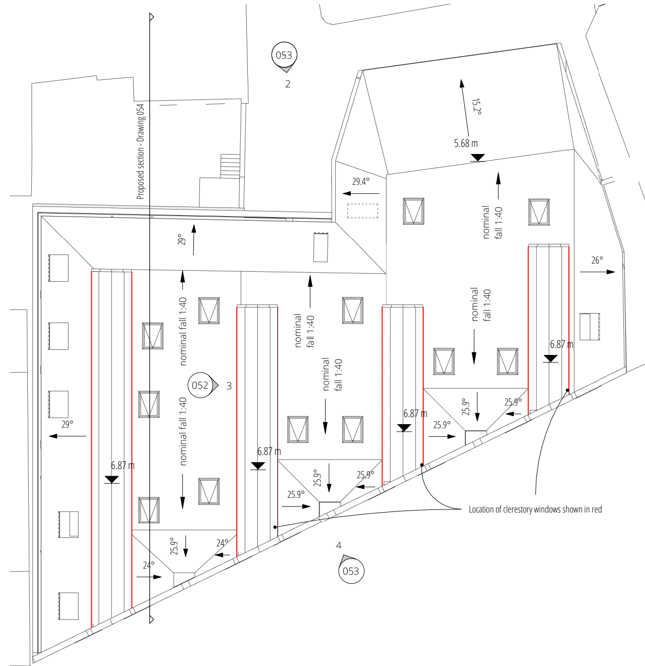
2 Proposed Roof Plan 1 : 200