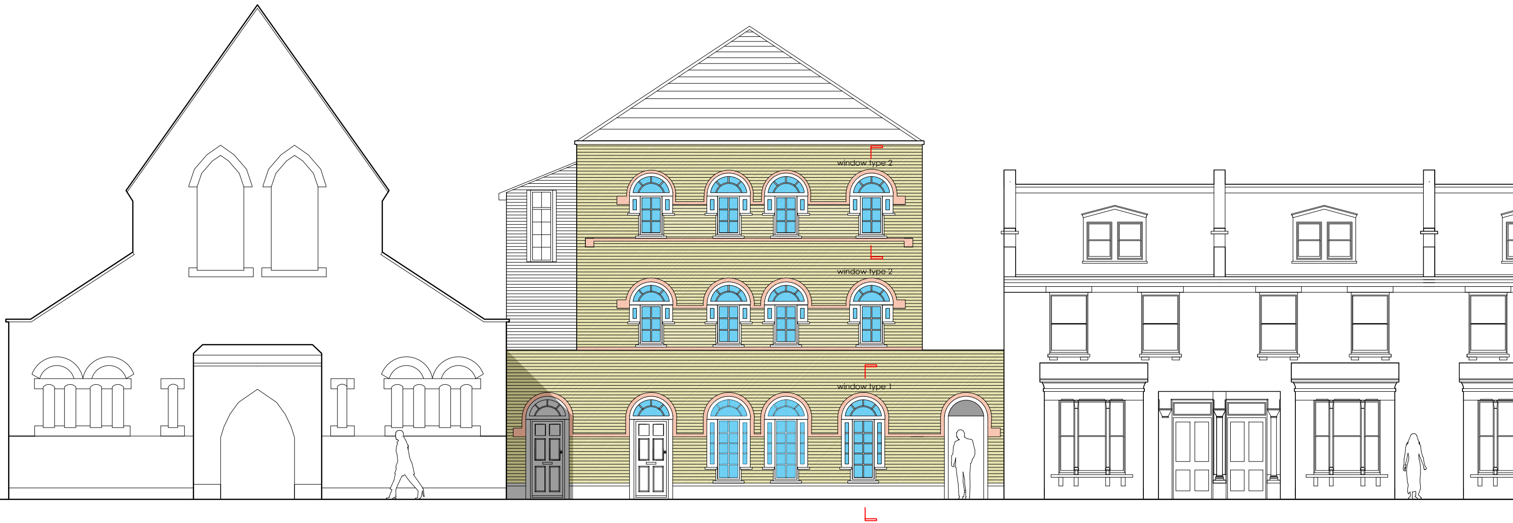
Front elevation proposed