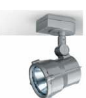
IGUZZINI WOODY 1400 EXTERNAL WALL-MOUNTED FLOODLIGHT