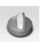
IGUZZINI TRICK 680 EXTERNAL WALL-MOUNTED WASHER