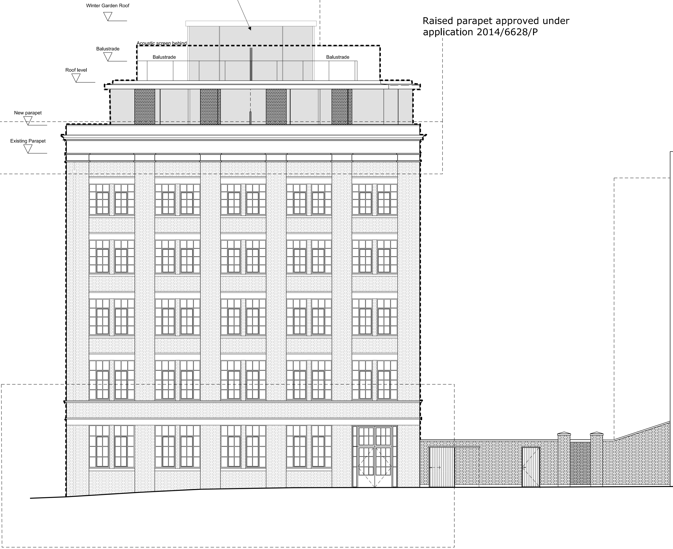
1 North elevation as proposed 152_303 Scale 1:100 @ A1 0m 1 2 3 4 5m

Glazing to areas as indicated will be suitably treated to reduce internal light spill in darkness