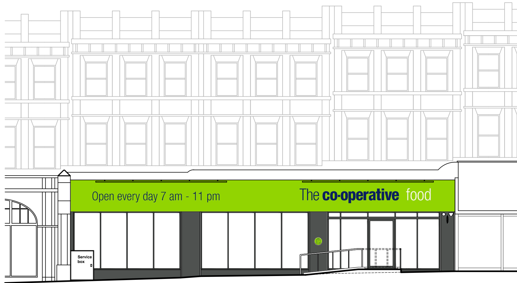
FRONT ELEVATION / SECTION B-B (SCALE 1:100 @ A3)

NOTE: DRAWING TO BE USED FOR PLANNING PURPOSES ONLY.