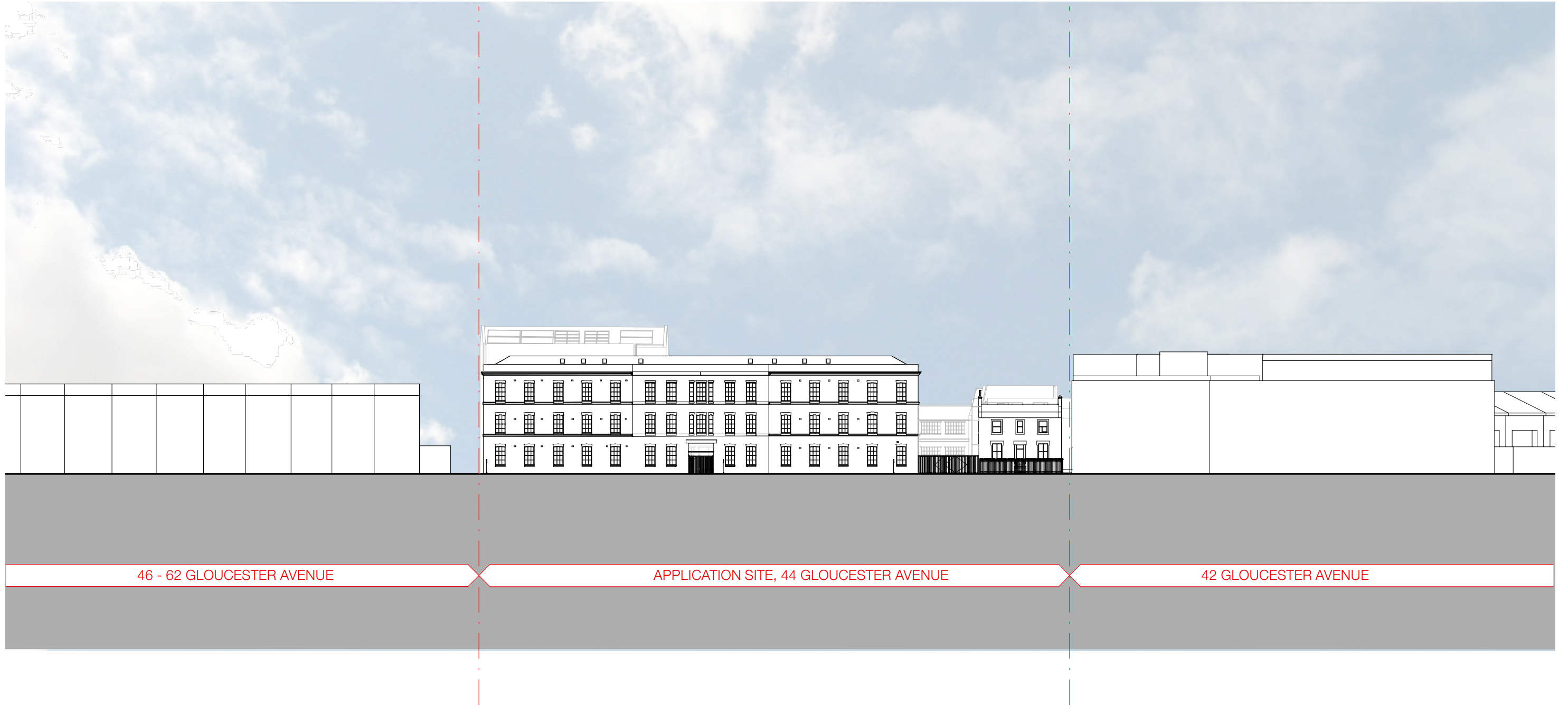
A Proposed Gloucester Avenue Elevation GE.04 1:1000 @ A1 1:500 @ A3