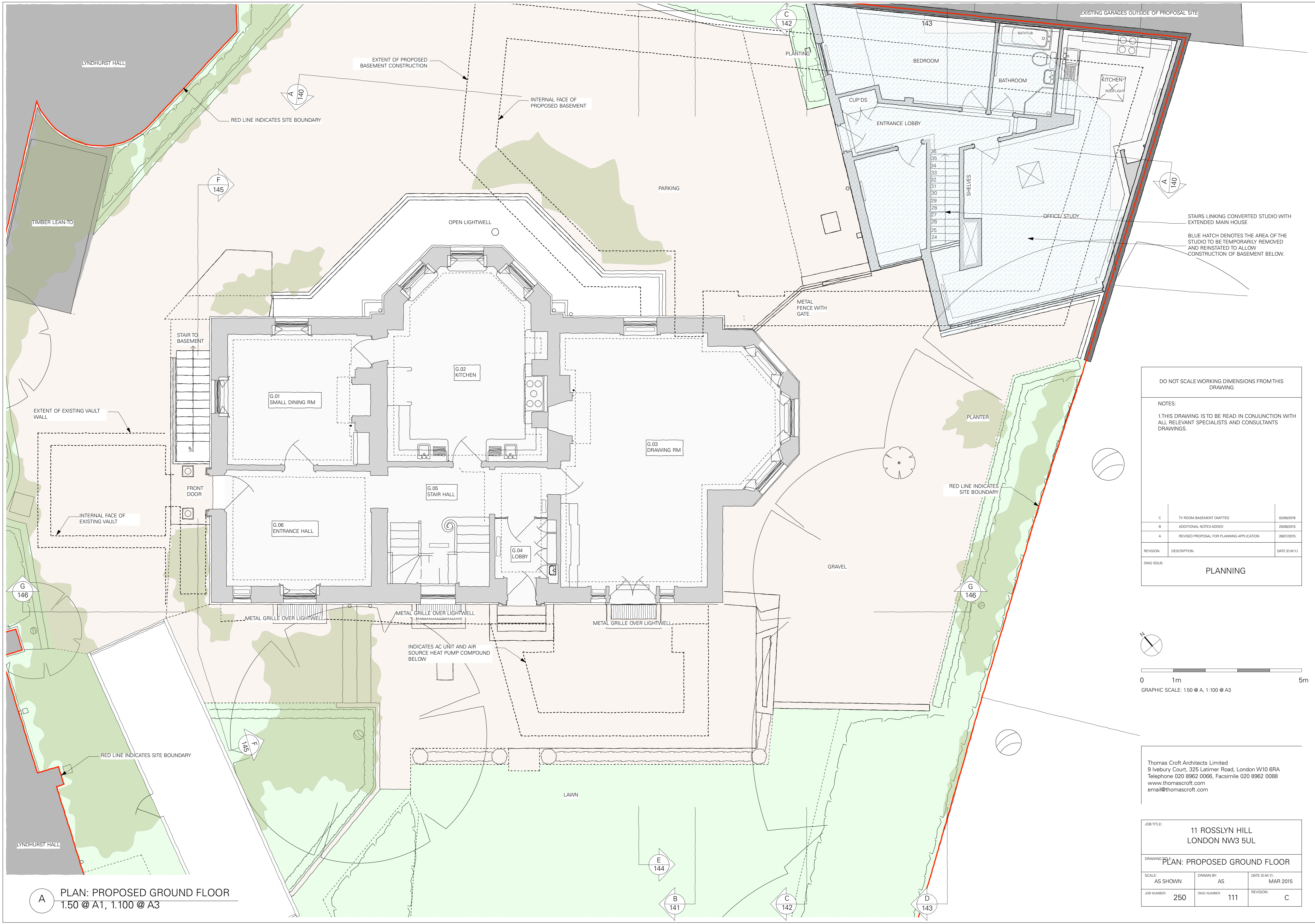
A PLAN: PROPOSED GROUND FLOOR 1.50 @ A1, 1.100 @ A3