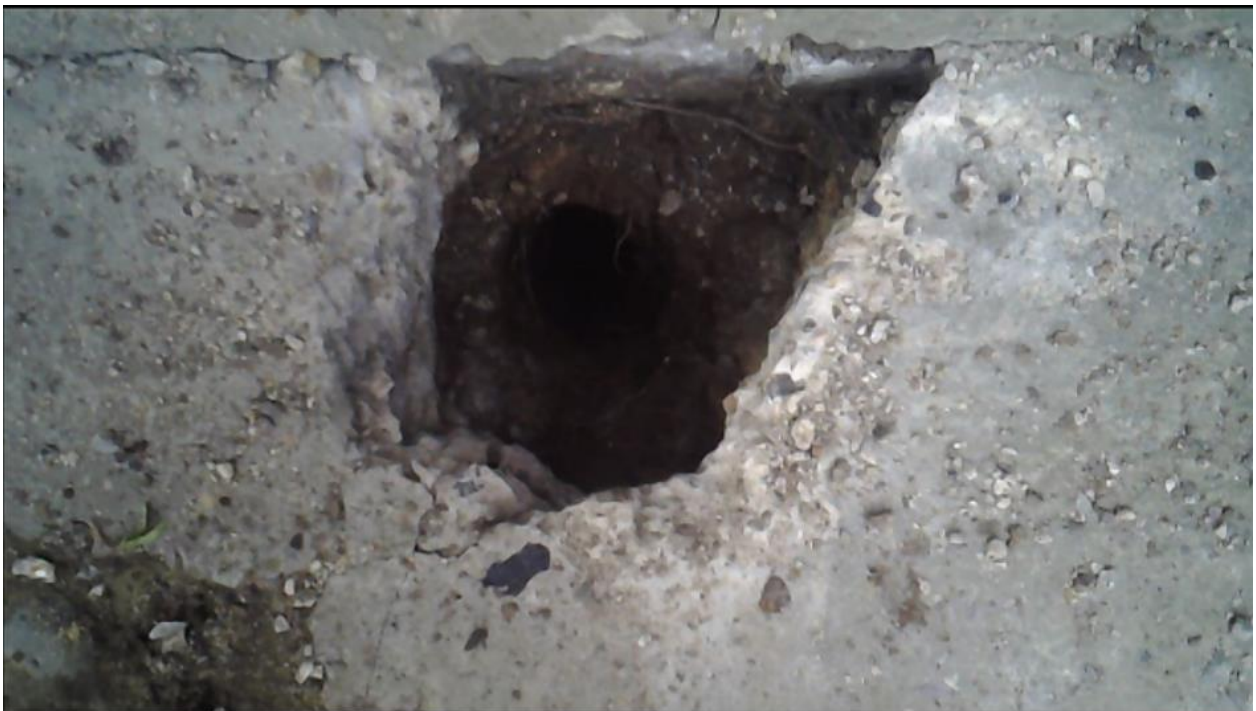
Image 2: showing the borehole upon completion (note roots visible within the open BH)