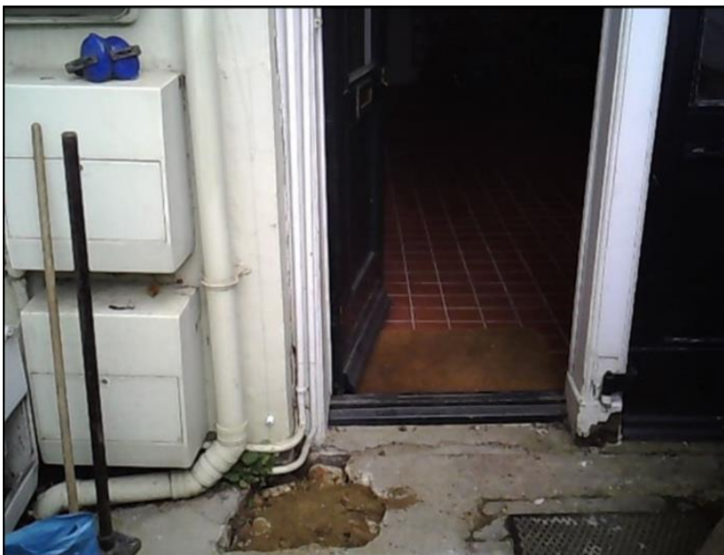
Image 5 showing TP/BH2 once finished