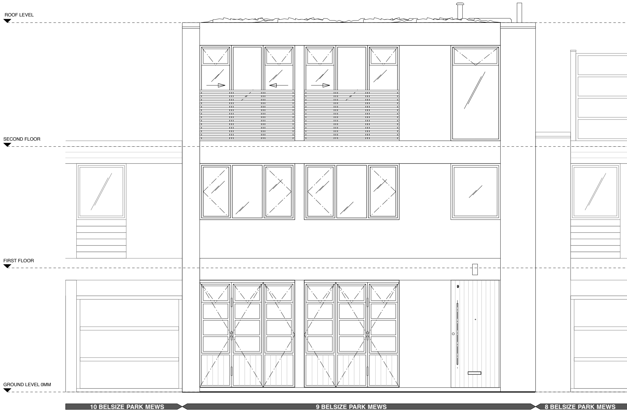
EXISTING - FRONT ELEVATION