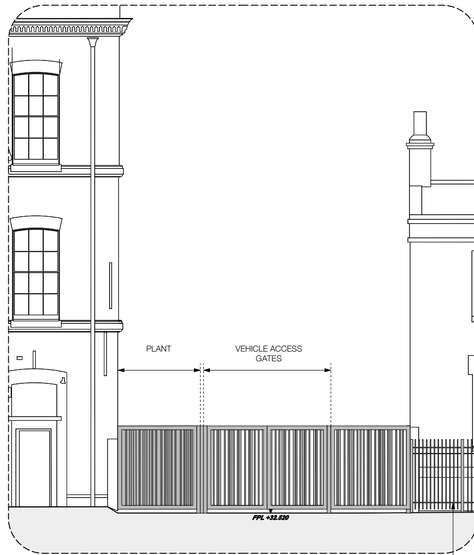
dE.02 Part Elevation (44a Gloucester Avenue) CD.7.07 1:100@A3, 1:50@A1