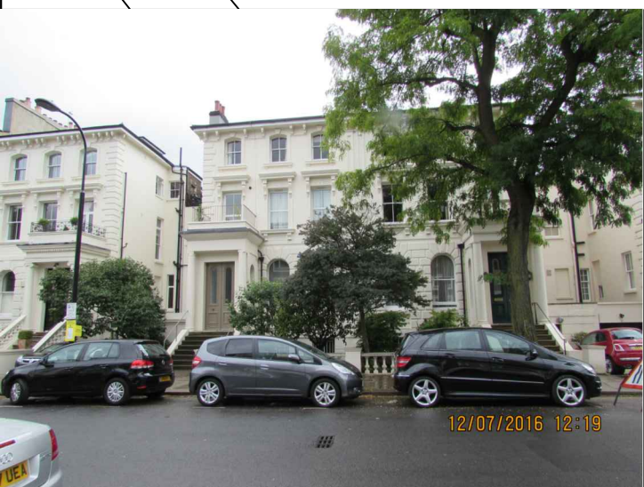
Photo taken from the north west side of Buckland Crescent looking towards the front garden of No. 41A.