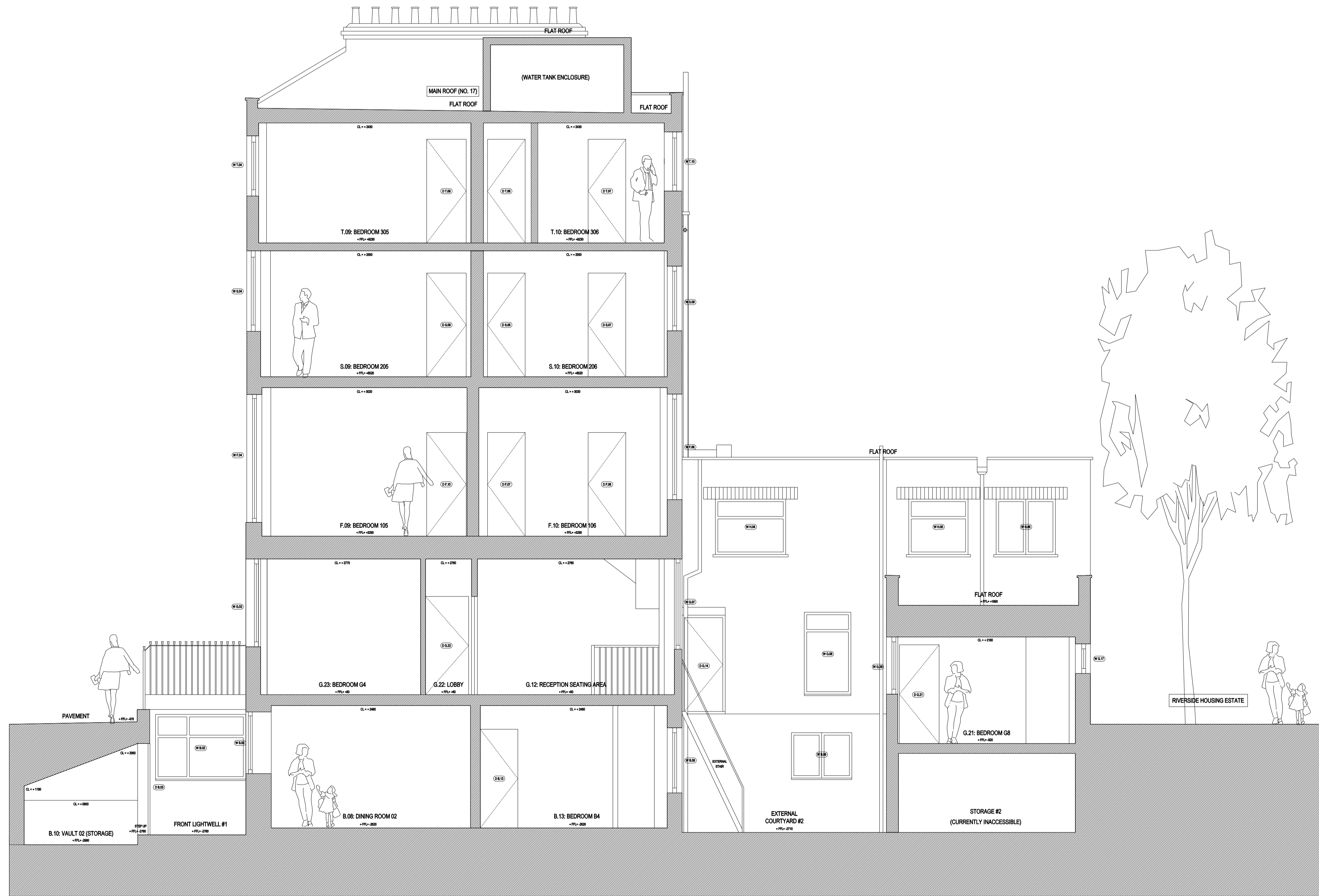
08 EXISTING SECTION 08 (15-02-08) Scale 1:50 (@A1 SIZE)