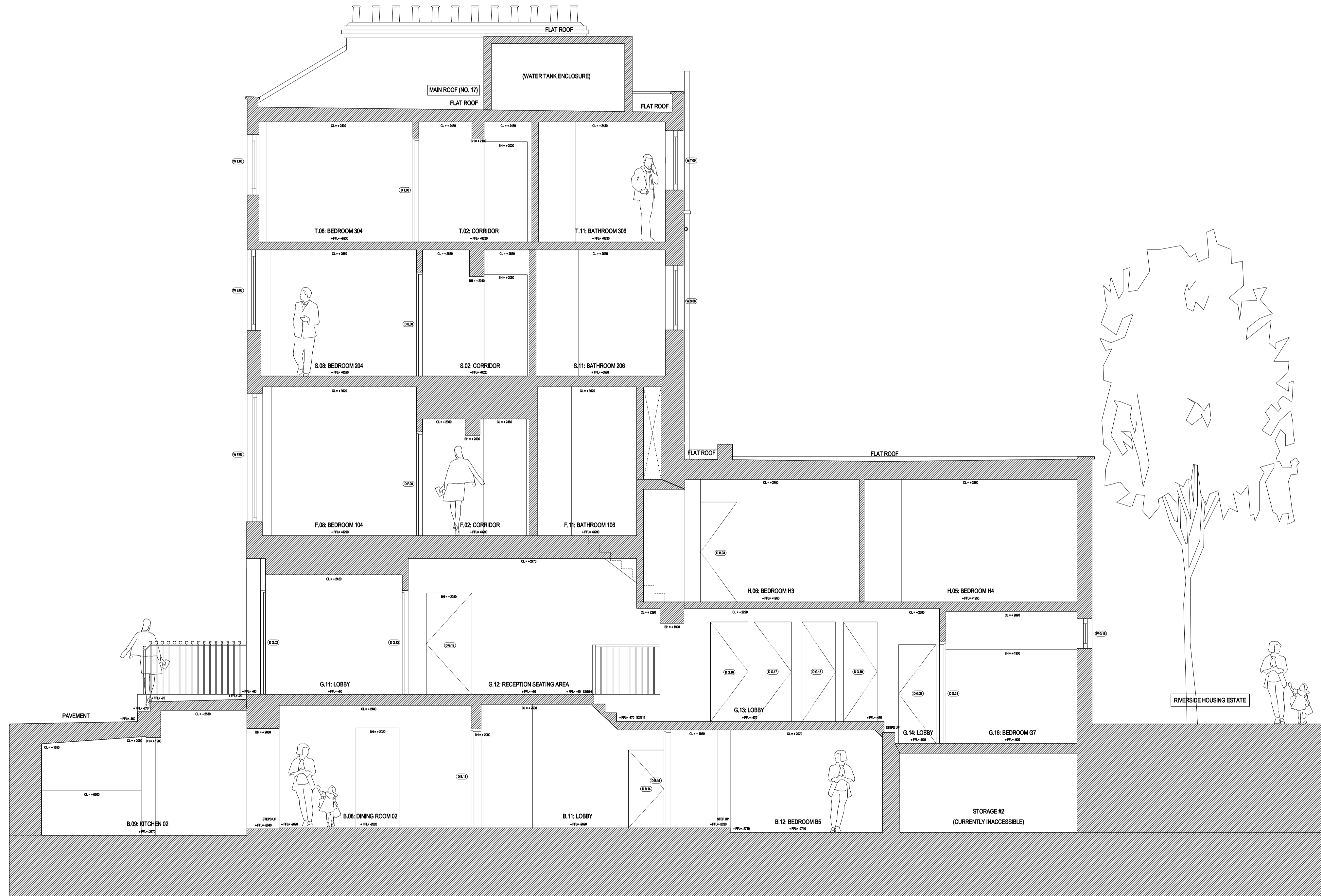
07 EXISTING SECTION 07 (15-02-07) Scale 1:50 (@A1 SIZE)