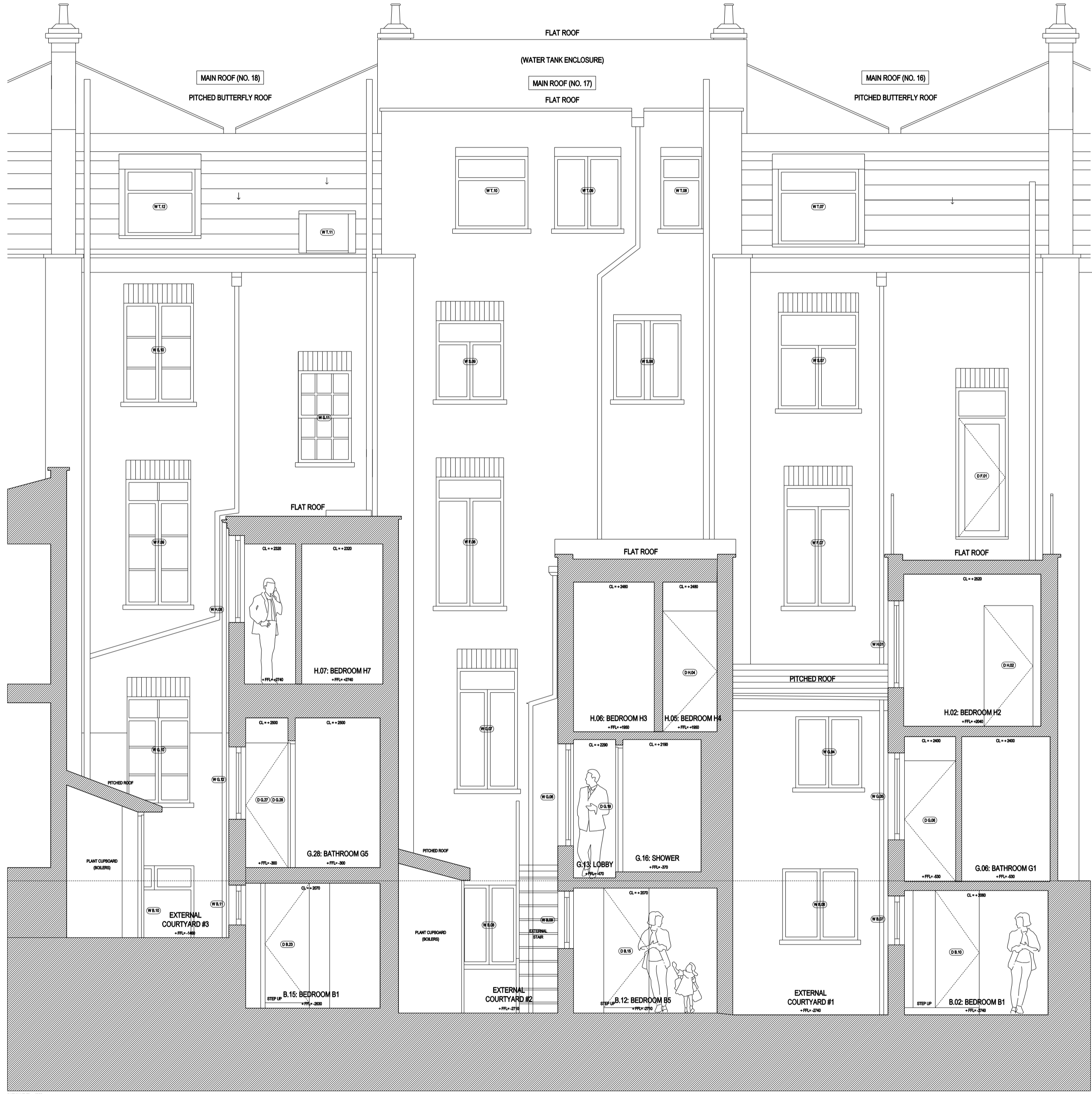
04 EXISTING SECTION 04 (15-02-04) Scale 1:50 (@A1 SIZE)