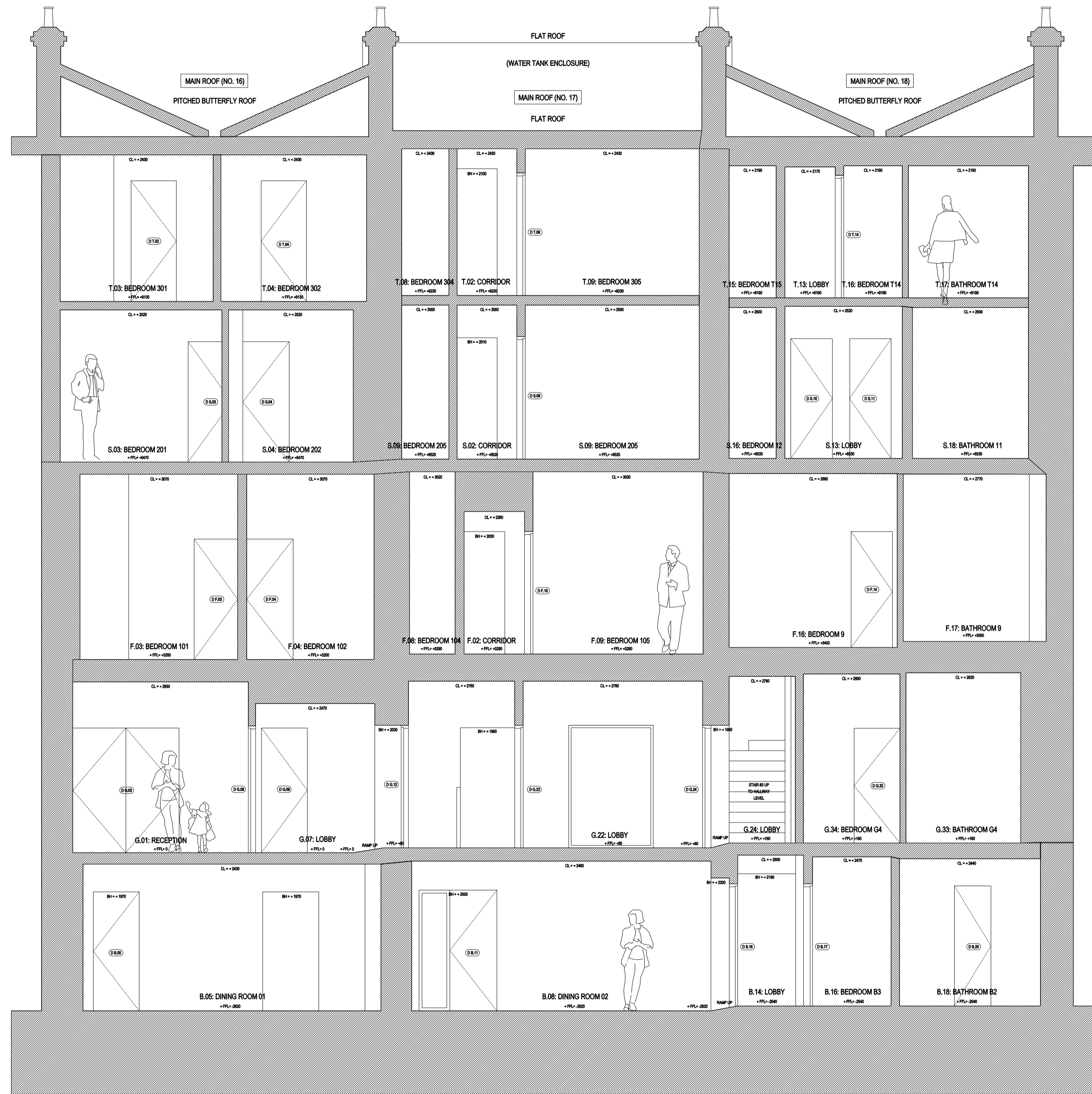
02 EXISTING SECTION 02 (15-02-02) Scale 1:50 (@A1 SIZE)