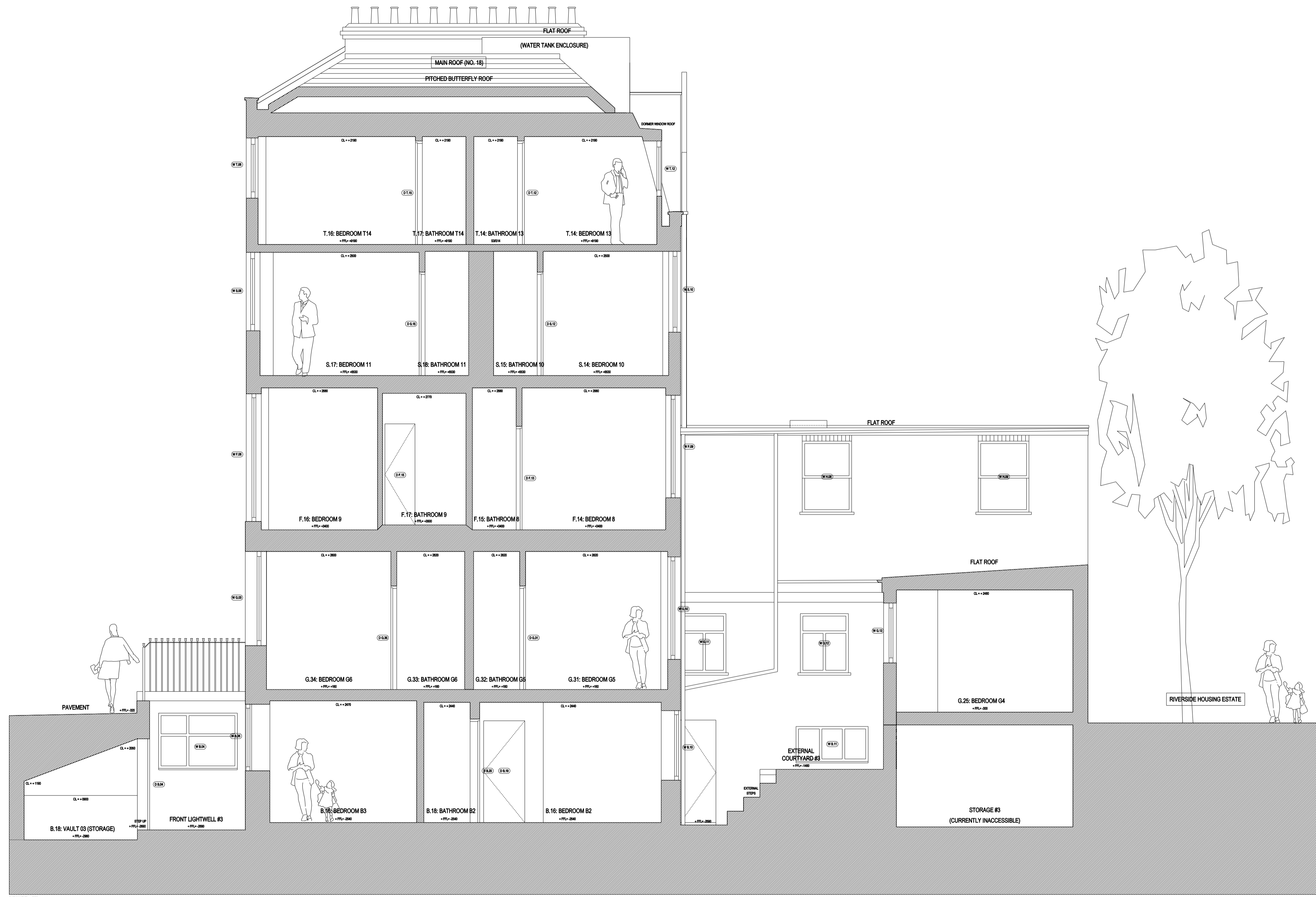
10 EXISTING SECTION 10 (15-02-10) Scale 1:50 (@A1 SIZE)