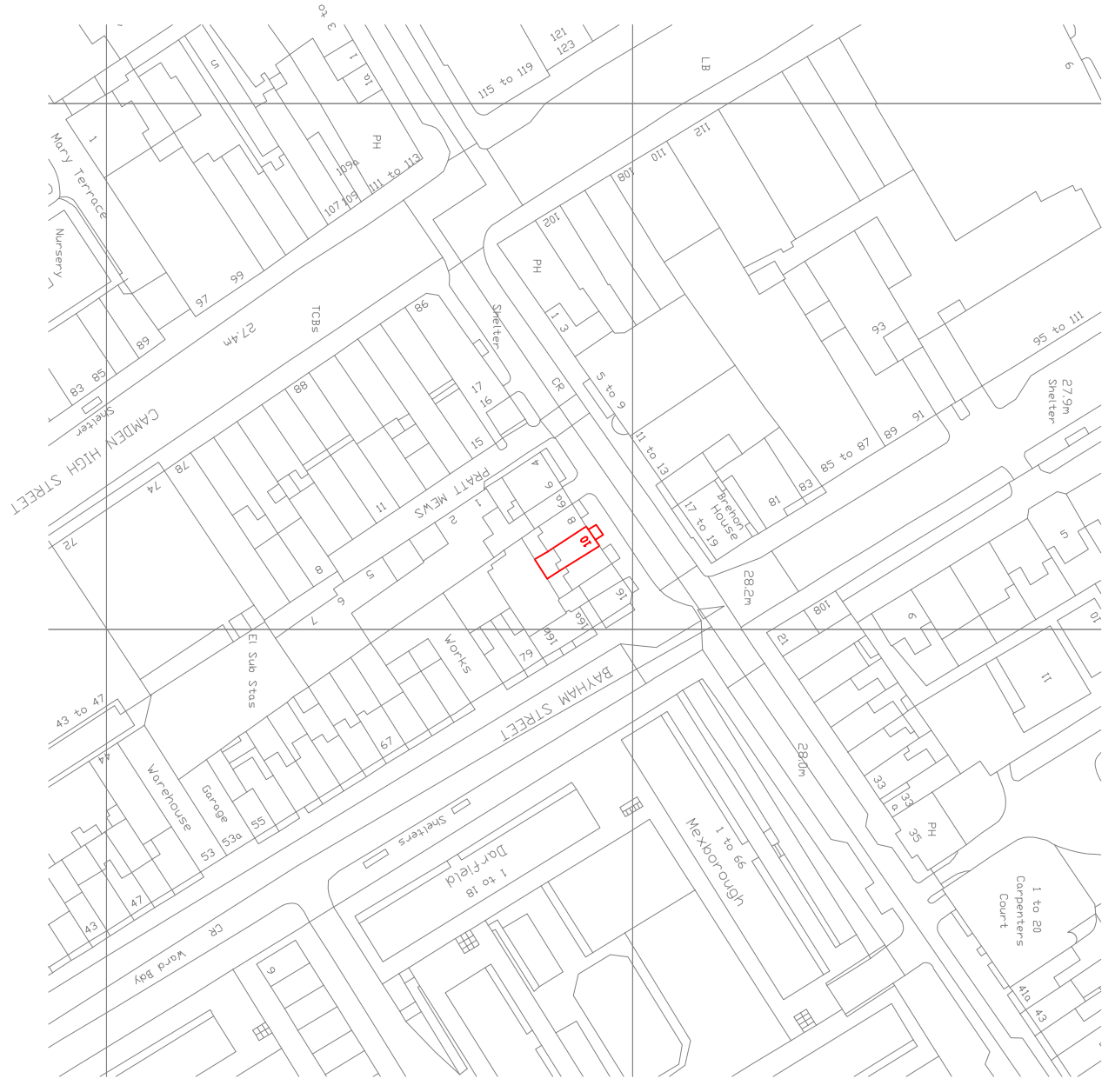
ORDNANCE SURVEY MAP @ SCALE 1:1250

scale : A3 @ 1:1250 & 1:500 date : 24.10.16 drawing number : 16874303 drawn by : JG